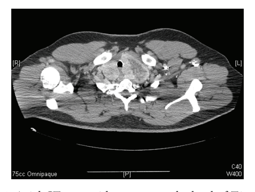
FIGURE 1: Axial CT scan with contrast at the level of T2, showing an enlarged thyroid gland, larger on the left, with tracheal deviation and inhomogeneous enhancement.