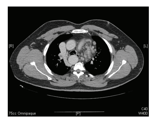
FIGURE 3: Axial CT scan at T5 revealing the presence of an incidental right-sided thoracic aorta.

DiGeorge syndrome, which was originally described in 1967 by Di George et al. [1], is associated with microdeletions of chromosome 22q11.2 and less commonly chromosome 10p13.