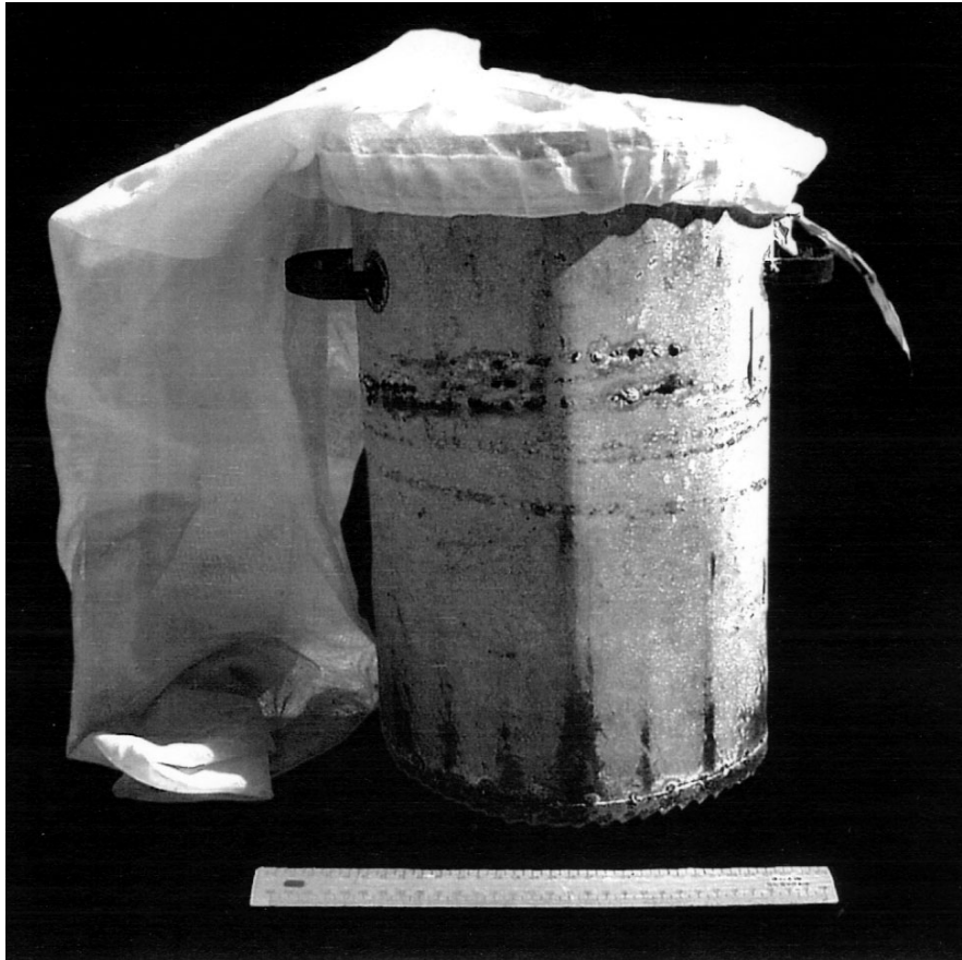
FIG. 1. – The 25 cm diameter sampler with collecting bag attached (scale = 30 cm).

Fieldwork was carried out during September 1998 in a pre-designated area measuring 50 x 100 m in Mellieha Bay (35°58.73'N, 14°21.85'E), Malta, central Mediterranean. This area supports a continuous P. oceanica meadow at a depth of 11-12 m. Mean shoot density was estimated at 646 \pm 108 \text{ m}^{-2} by counting the number of shoots enclosed by five replicate 35 x 35 cm quadrats. Sampling was carried out by SCUBA diving, during which six replicates were taken randomly using each of the three different corers. Adjacent samples were at least 10 m apart and collections were always made in the afternoon. During each collection, the sampler was placed over the P. oceanica and the serrated edge was lowered quickly onto the bed. The sampler was held by the handles and driven slowly into the root-rhizome stratum by a turn-cutting action until a vertical penetration of 10 cm was achieved. A 'Bushman garden knife' was then used to make vertical incisions in the matte surrounding the sampler to produce a small 4-5 cm wide gap between the matte and the outer wall of the corer into which the diver's hand could be inserted. Incisions in the matte angled