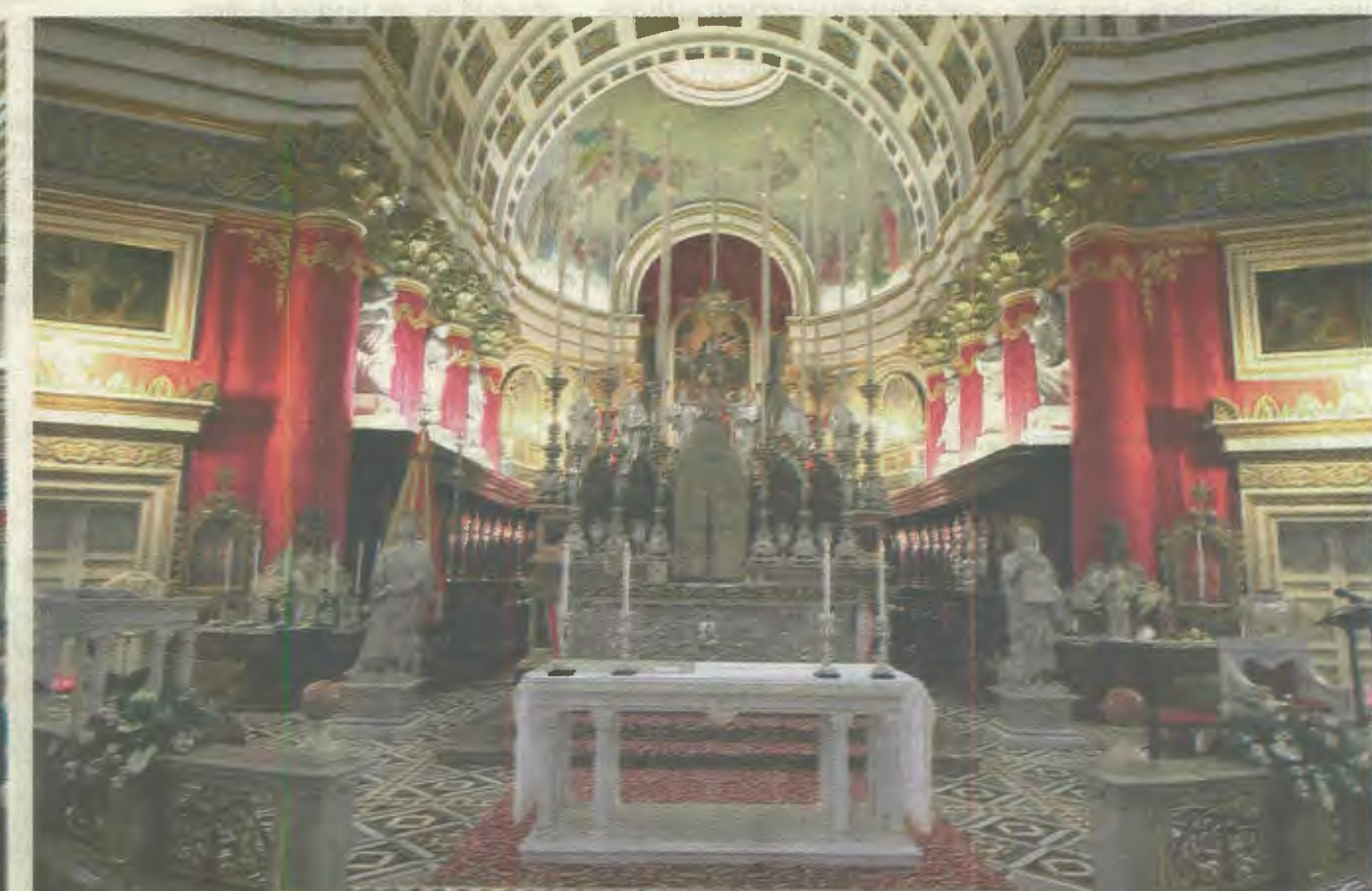
Main altar of the sanctuary basilica of the Assumption, displaying the umbroculum and tintinnobulum. While the umbroculum was inaugurated by the parish in time for this year's feast of the Assumption, the tintinnobulum was kindly lent for the occasion by the sanctuary basilica of Our Lady of Mount Carmel, Valletta.

Inscribed marble plaque commemorating this momentous event.