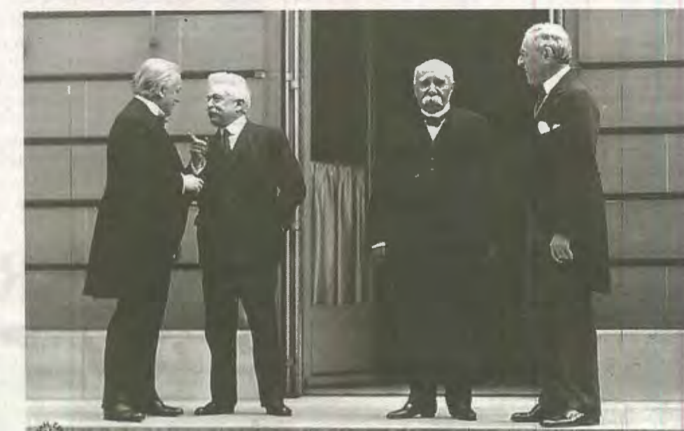
The heads of the Big Four nations at the Paris Peace Conference, May 27, 1919, (from left) David Lloyd George, Vittorio Orlando, Georges Clemenceau and Woodrow Wilson.