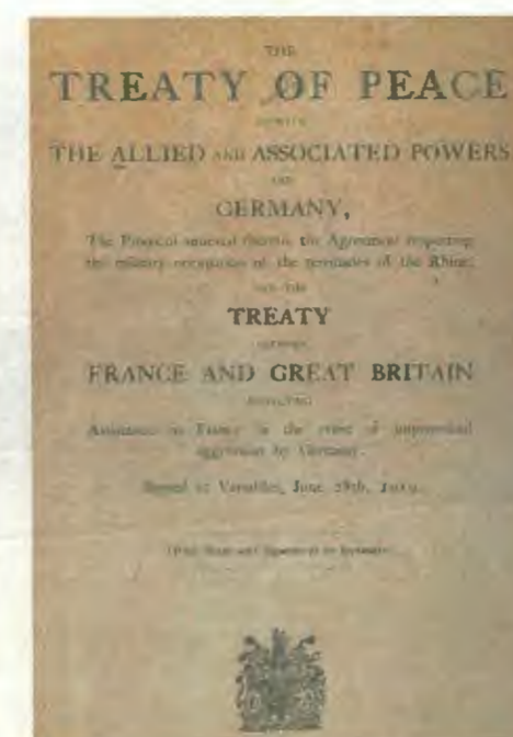
The Treaty of Peace between the Allied and Associated Powers and Germany.

It is interesting that after Germany crushed France in May-June 1940 during World War II and the French surrendered, Hitler deliberately chose Compiègne forest as the site to sign the armistice due to its symbolic role as the site of the 1918 Armistice of November 11, 1918, that had ended World War I. It is also interesting to note that Germany made its last reparations