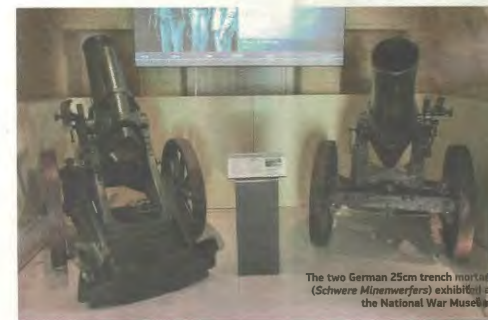
The two German 25cm trench mortars (Schwere Minenwerfers) exhibited at the National War Museum.