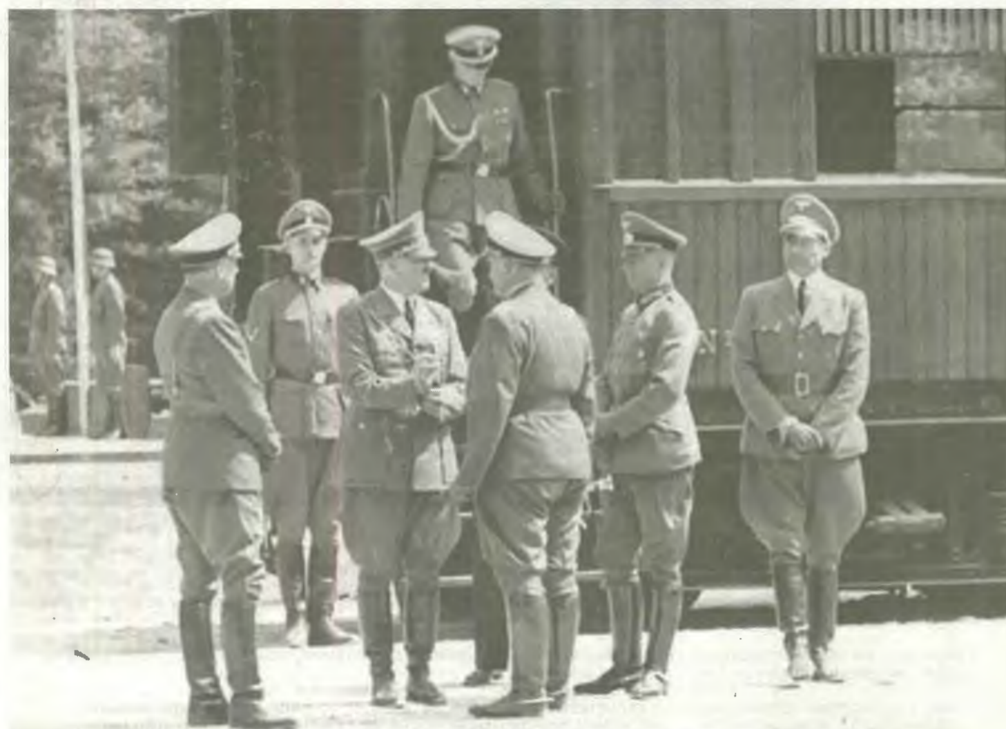
The signing of the armistice following the French surrender in World War II, in Compiègne, France, on June 22, 1940, was held in the same railroad carriage where the 1918 Armistice had been signed. Photo shows Adolf Hitler (centre) and other Nazi officers in front of the carriage.