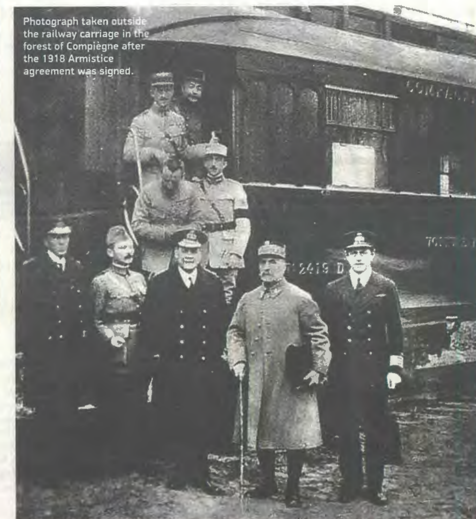
Photograph taken outside the railway carriage in the forest of Compiègne after the 1918 Armistice agreement was signed.