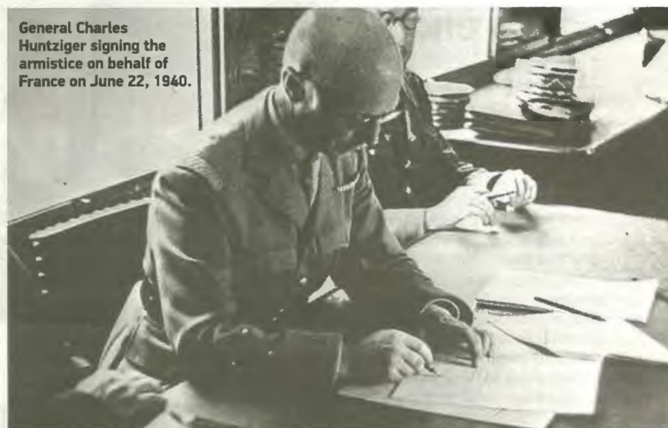
General Charles Huntziger signing the armistice on behalf of France on June 22, 1940.

In his address, the Governor told the multitude: "The day has at length come which we have longed for during the last four and a half years. This war has been waged for religion and freedom from thralldom, and as Mr Lloyd-