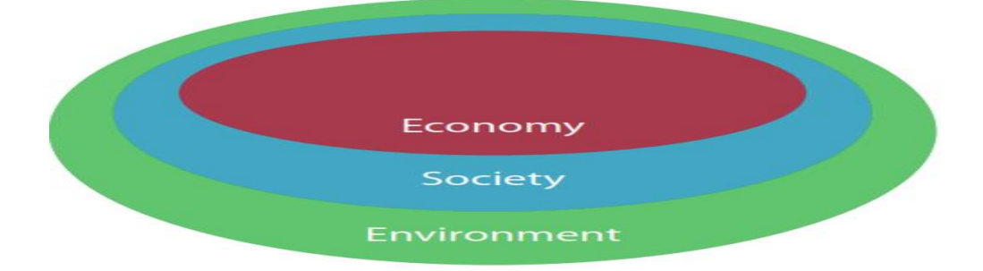
Figure 1. Components of Regional Development

The key challenge facing many developing regions around the country is the need to respond to population and economic growth. In that sense it is important to take into account three important pillars for equal regional development as below in Figure 1: