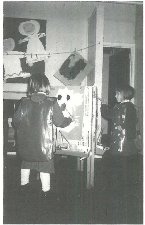
Observing creative tasks in the primary classrooms. Research in Belfast by Dalmas and Micallef, supported by the SOCRATES programme.

A number of students from the faculty of Education were able to benefit from the SOCRATES programmes in terms of funding for their educational research visits. Visits to Sweden and Norway were undertaken in connection with a unit in Early Childhood Education, which is offered to the third year B.Ed (Hons) students who are specialising in the teaching of young learners. For the unit Observations in Early childhood Education students were given the possibility to visit and observe teaching in schools overseas. Two B.Ed (Hons) students specialising in the teaching of English, were able to conduct a period of educational research with the aim of evaluating teaching and learning strategies in the primary classrooms in Belfast, Northern