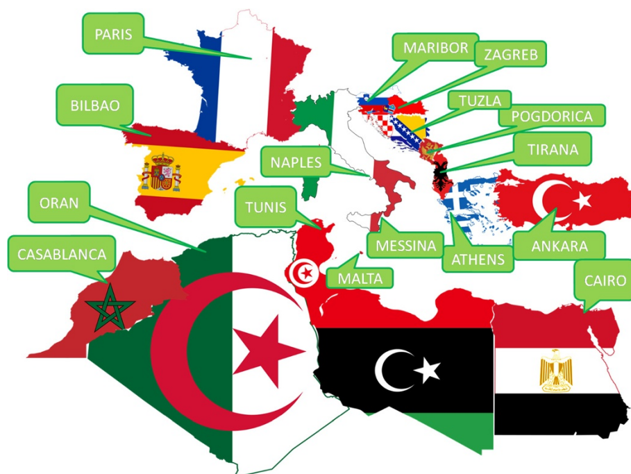
Figure 1 Map of referral centers in the participating countries.

Based on the facilities and tests available in each center, for each case we estimated the probability of being diagnosed with CD by the new ESPGHAN diagnostic criteria alone, without small intestinal biopsy. For each case we summed up the number of diagnostic criteria met (clinical symptoms, tTG above 10 folds the upper limit of normal and specific HLA). The sum of the criteria determined the final diagnostic score, which thus ranged from 1 to 3. To reduce large tables, countries were often aggregated within their geographical region (Europe, Balkans, North Africa).