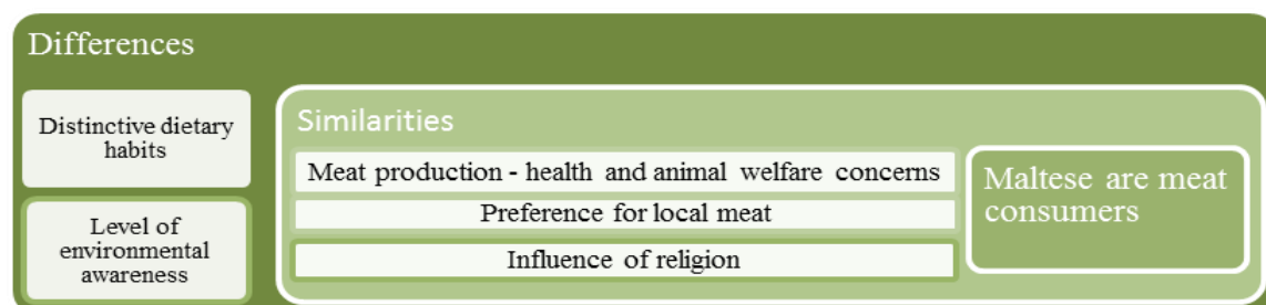
Figure 2: Trends in meat consumption in Gozo and NHD

The first four themes reflect similarities among both districts' focus groups while the latter two reveal marked differences (see Figure 2).