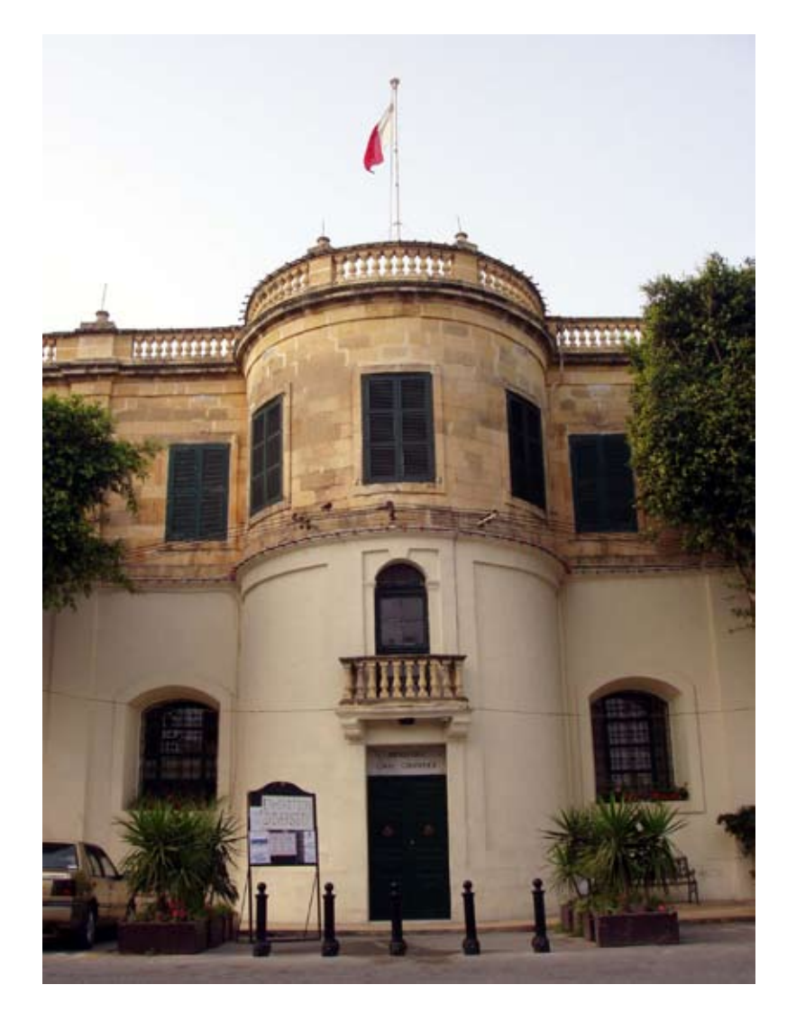
The Offices of the Ministry for Gozo at St Francis Square Victoria Gozo. The University Gozo Centre finds ongoing support from the Ministry for Gozo.