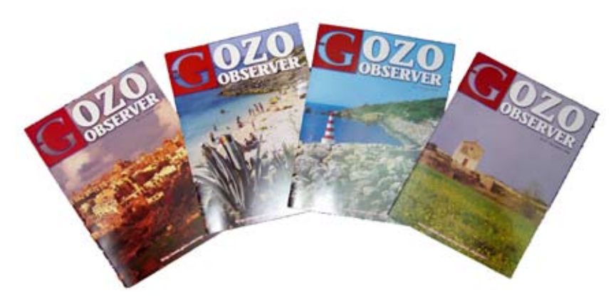
Four issues of 'The Gozo Observer', published by the University Gozo Centre.