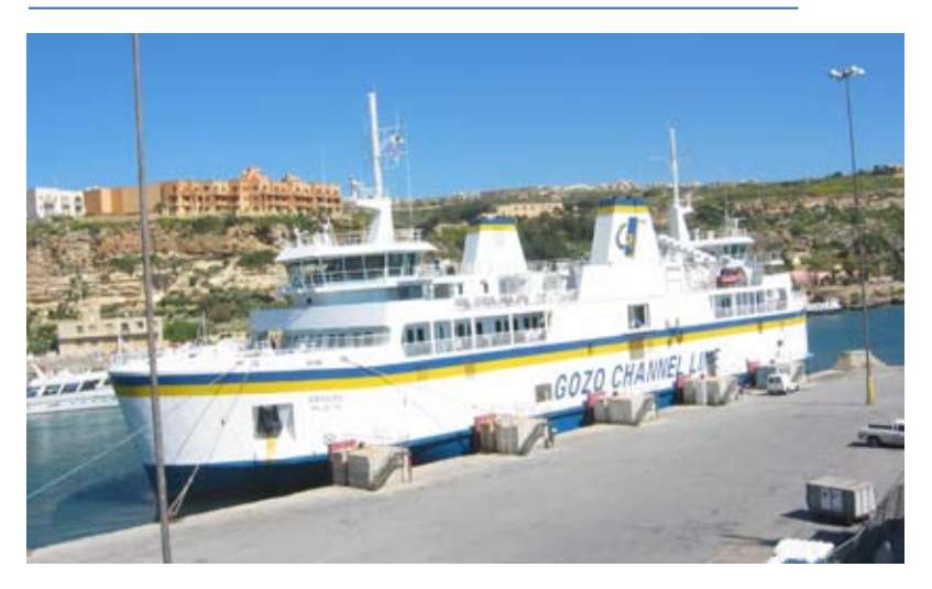
With the introduction of new ferries, crossing over to Gozo has become less time-consuming for lecturers.