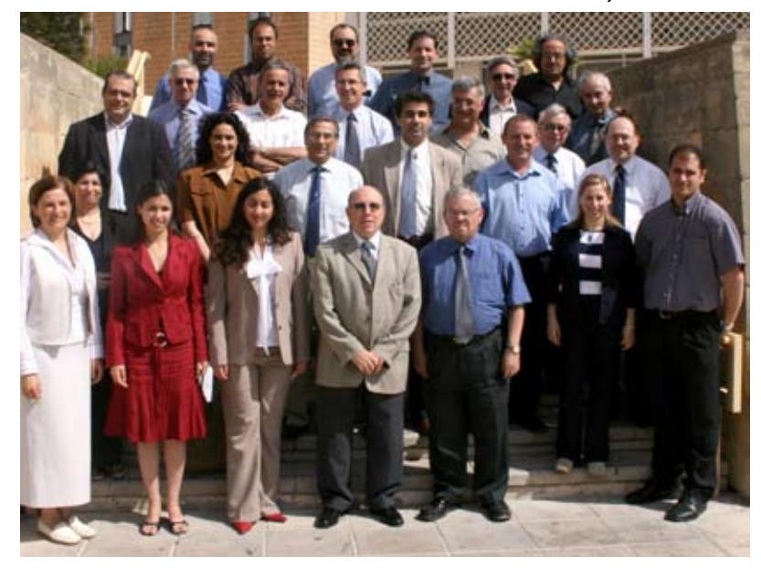
Some of the University of Malta lecturers who offer their services at the University Gozo Centre.

whether they wish to have a hotel booked for Friday night. Paradoxically, even though most lecturers have to travel from Malta, lectures are very rarely missed, even when the Ferry service is suspended. In such cases, arrangements are made to have the lectures postponed. In certain instances, when the lecturer finds it difficult to cross over to Gozo, video-conference facilities are utilised.