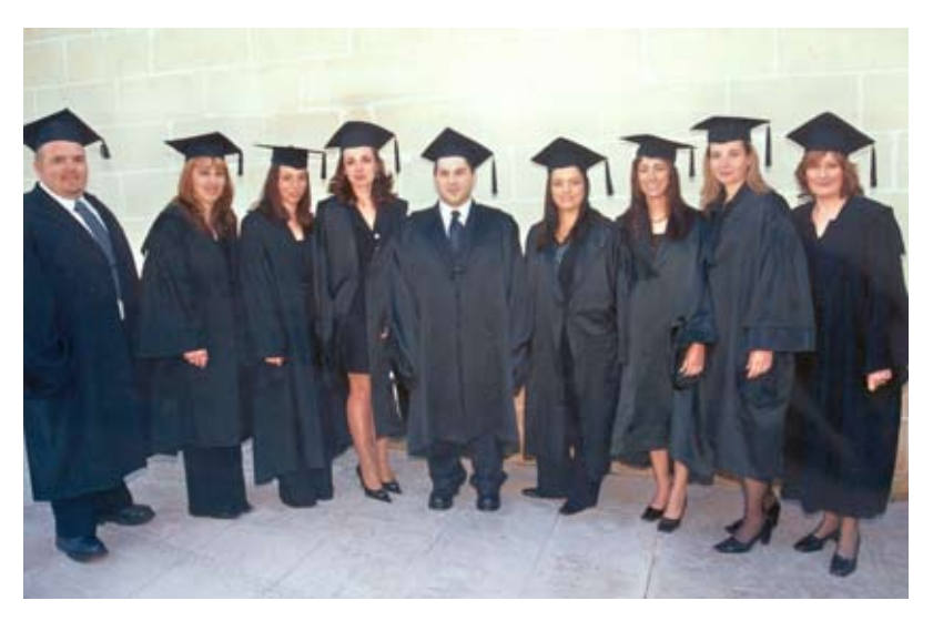
Gozitan students just after the conferment of the Diploma in Commerce in November 2004.

Even though crossing to Gozo repeatedly and very frequently has its downsides, overall lecturing in Gozo is a lovely experience. It provides the right combination for every lecturer: excellent administrative facilities, well-organised premises, attentive and motivated students and nice colleagues, with whom I often share dinner on Friday nights.