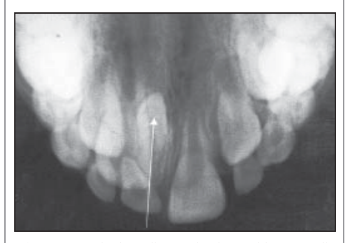
Figure 1: Standard Maxillary Occlusal view of the premaxilla, showing an unerupted, inverted mesiodens (arrowed). 21 is magnified and indistinct, indicating it's position as being buccal to the arch.

A healthy 9 year old boy was referred by his General Dental Practitioner to the School Dental Clinic (SDC) Floriana, because of delayed eruption (>2 years) of the permanent upper left