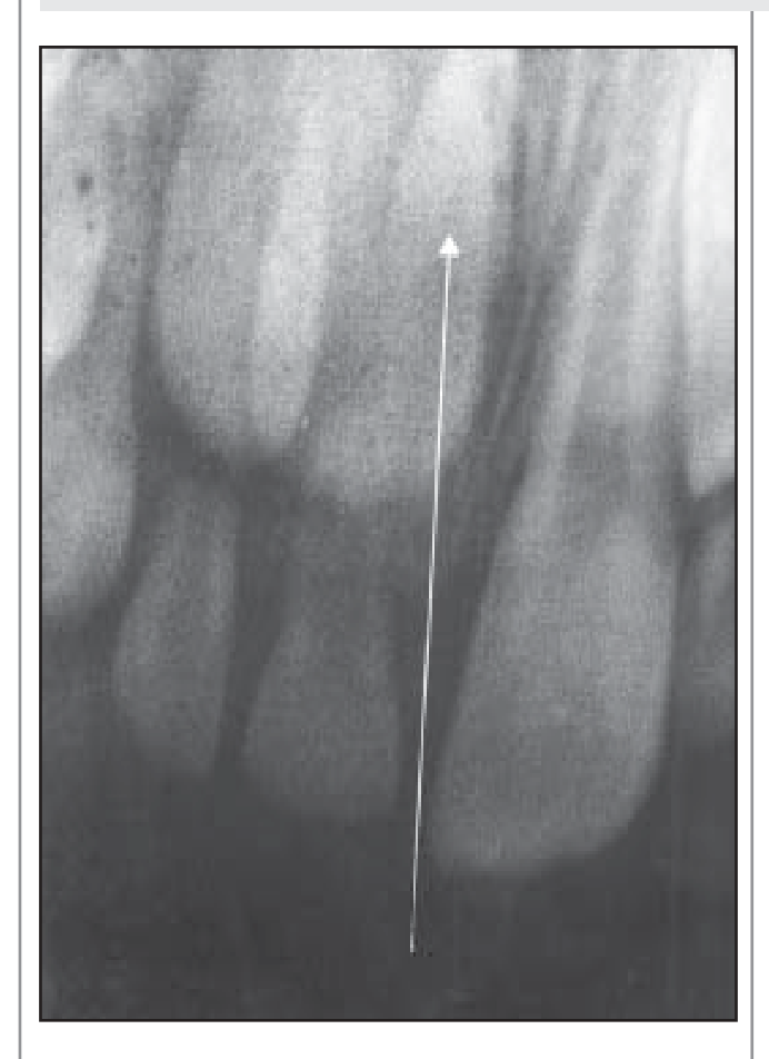
Figure 2: Intraoral periapical view taken with a distal tube shift for localization using horizontal parallax. The mesiodens (arrowed) has moved distal relative to the root of the deciduous central incisor and the crown of the buried permanent incisor, indicating it's position as palatal to the line of the arch.

central incisor (21). A Standard Maxillary Occlusal radiograph (SMO) was taken (Figure 1). The radiograph revealed a mesiodens and an unerupted 21. A periapical radiograph of the upper left incisor region was taken to reveal further detail of the area and for localization of the mesiodens using the parallax radiographic principle (Figure 2). This showed the mesiodens to be located palatal to the central incisor.