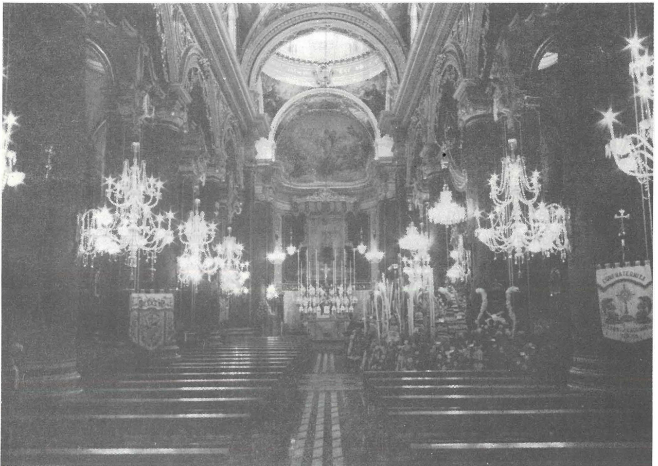
Sanctuary of Our Lady of the Sacred Heart, Sliema

The statue is not only one of the most beautiful on the island, but it is the subject of a devout cult. It is brought