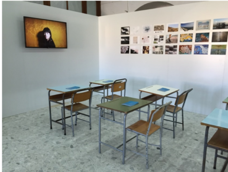
Figure 5: The installation Arçipelagu in an old examination centre in Valletta, Malta (2018)

pants as well as oneself. This brings me to a more recent artistic project that I initiated in 2017 and presented in public in 2018, with the participation of over thirty emerging artists based on islands around the Mediterranean. Called Arçipelagu (Archipelago), the project formed part of a larger exhibition and was influenced by the recent field of island studies and linked art practice with education and curation. The venue chosen by the exhibition's curator Maren Richter provided the project with a direct and historical connection with the educational domain as well as, more indirectly, the hegemonic influence of a history reeking of colonisation. This was an old examination centre in the St Elmo area of Valletta in Malta, a place that had been associated for many years in the last century with Ordinary and Advanced level examinations that the Maltese had inherited from the British educational system. In 2017, the derelict building still contained scores of school tables and chairs used during examination sessions, and some of these were retained for Arçipelagu . An international open call for participation was issued and disseminated with the help of online journals, academics and cultural workers based on different islands in the Mediterranean region. Using images, text and video, all potential participants were asked to