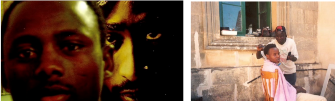
Figure 2 & 3: Photographs taken during the project Your eyes, my eyes: Images of displacement a group of prospective art teachers and young irregular migrants from different parts of the African continent soon after I began to coordinate the art education programme at the University of Malta in 2004. At the time, the number of irregular migrants and asylum seekers arriving by boat on the small island of Malta from northern Africa was on the rise and simply broaching the subject in any public forum or educational context was potentially contentious. Our aim was to work with a group of migrants who had been separated from the larger community of African migrants because they were minors who had arrived in Maltese territorial waters without legal guardians. Using cameras, some basic training in photography and discussions about framing strategies, each group would tell its 'story' about itself in relation to the other group, beginning from the same location (Malta) but becoming critically aware of the limited parameters of one's personal vision and the educational obligation to transcend an oppositional discourse. Initial hesitation in the early sessions and fear of objectification of members of the other group led some Maltese students to portray their encounters indirectly, by focusing on close-up fragments and textures, but follow-up meetings helped them to become more uninhibited and friendly. Some Eritrean, Somali and other migrants shot images of the open sea and landing sites, indicating the route that could possibly take them back to their starting point in Libya. Others photographed daily activities or celebrations, including their meetings with the undergraduate