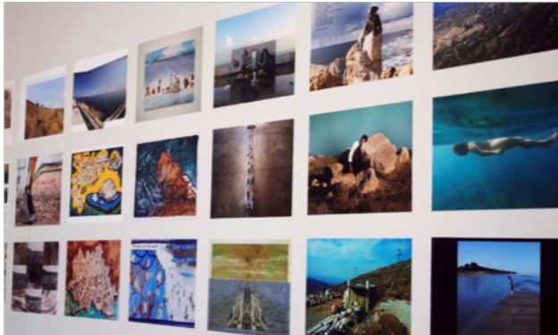
Figure 6: Images by emerging artists from different islands around the Mediterranean

respond to a single question: Is an island a place one escapes to or escapes from? The question was intended to elicit reflections about the localised epistemologies of different islanders and the mediated narratives that reduce the value of the coastline to a more recent form of conquest and exploitation, that of the tourism industry.