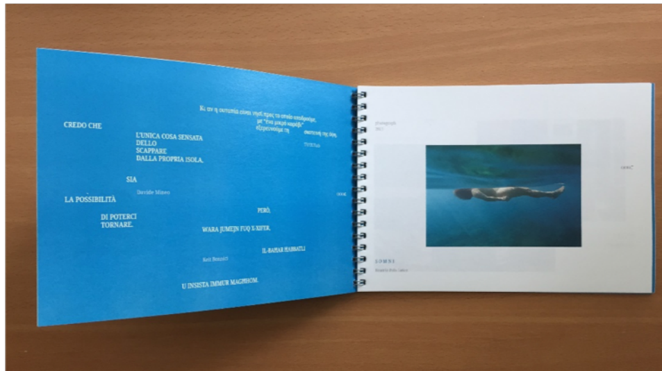
Figure 8: Artist's book with multilingual texts, 2018

Of course, other archipelagos are possible, involving different islands, languages and classroom arrangements. If we are to keep archipelagic options as open-ended as possible, the very land we inhabit needs to be a place fraught with various tensions, an ephemeral site in motion or dis-placed land. A land that comes and goes. To imagine such a place, it would help if we employed yet another island trope which undermines the solidity and permanence of land, for there can be no “root identity” if the very land one feels rooted to is impermanent. I am referring to the existence of ephemeral islands—seamounts that occasionally rise to the surface of the sea as a result of volcanic activity, only to get eroded and disappear after some months or years. A good example of such a natural phenomenon lies around 30km southwest of the island of Sicily, not far from the island of Pantelleria (Fig. 1). This is a volcanic area which has, at different times in history, given rise—quite literally—to a submerged island with a handful of names (Kozák & Čermák, 2010, pp. 77-78). Its emergence and growth to around sixty metres above sea level in July 1831, along with a very visible display of volcanic gases, instantly transformed it into a new patch of land to colonise. A British ship was dispatched to plant the Union Jack on the island, its captain naming the strange crop of volcanic tephra Graham Island. The Kingdom