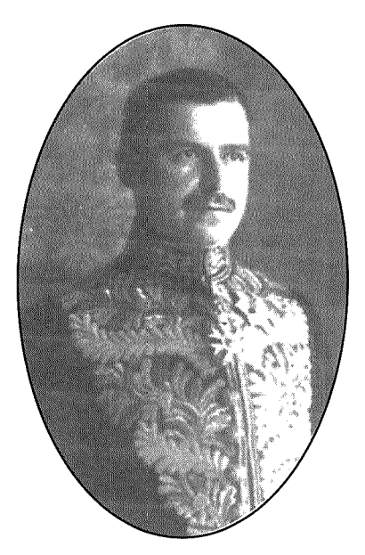
Fig. 4 Count Gerald Strickland.