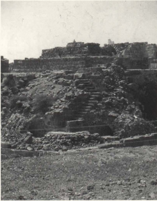
Belvoir Castle, Israel