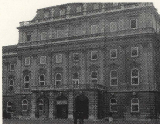
National Library of Hungary, Budapest