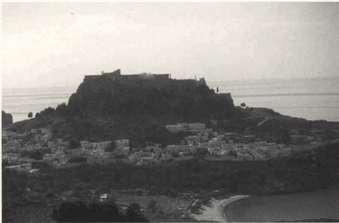
Lindos Castle, Rhodes

tributes and lands. The Hospitallers, isolated from the rest of the Christian holdings in the Latin East, surrendered the castle to Baybars in February 1271.