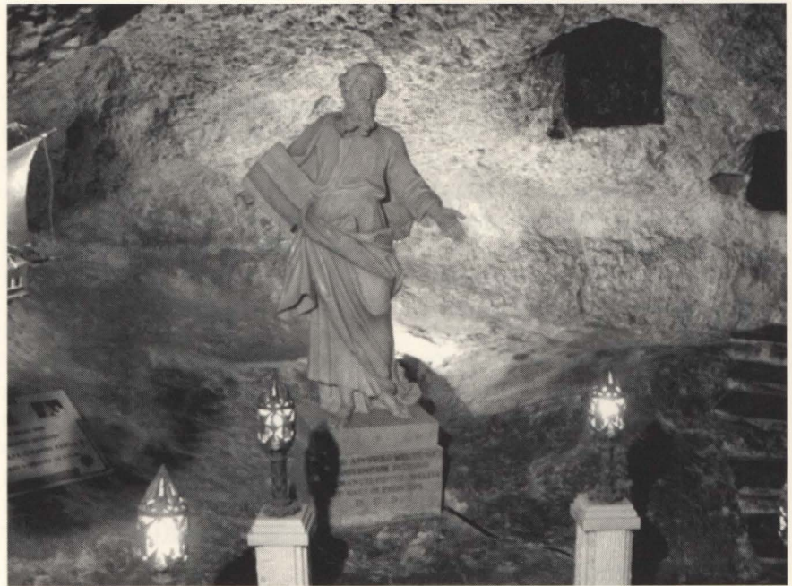
The interior of St. Paul's Grotto, with the statue of St. Paul.

Today, the Wignacourt Museum is one of three buildings (the other two are St. Paul's parish church and