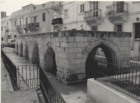
The fish tank, rebuilt as a wash house in the early 18th century