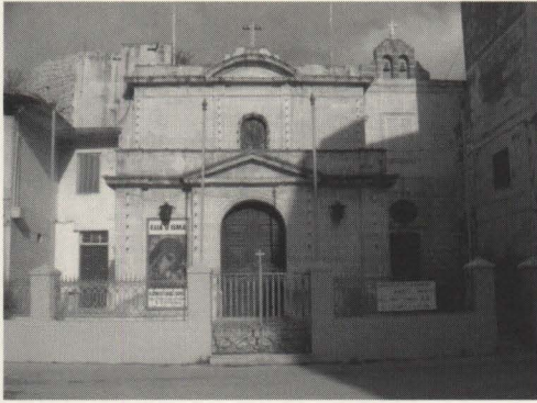
The former parish church in Msida, Malta, site of the apparition