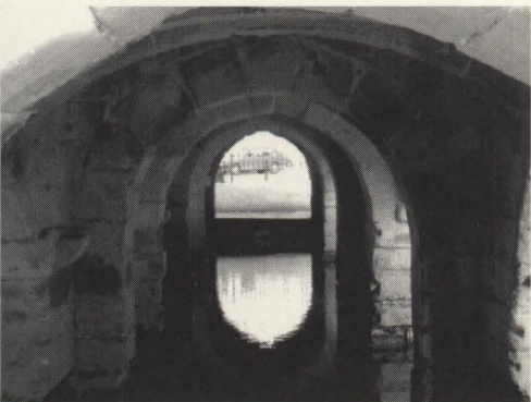
The interior of the wash house, which still contains water