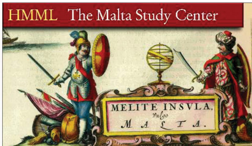
Above: The Malta Study Center's first Home Page, 1995.