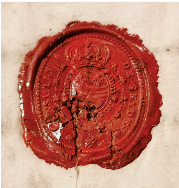
Left: Wax seal of the Consulate of Sidon (Lebanon). Lettere consolari fonds, Cathedral Archives, Mdina.