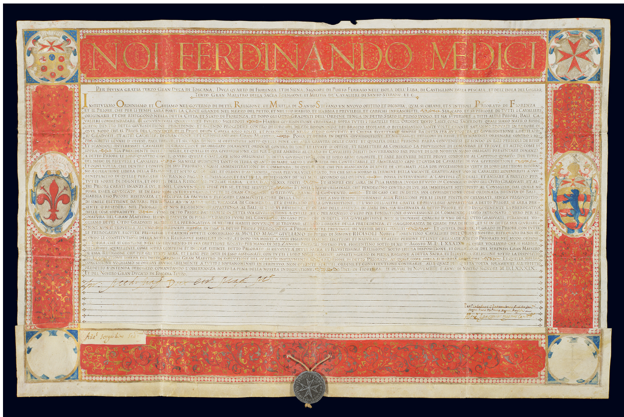
Above: Privilege of Ferdinando I, Grand-Duke of Tuscany, concerning the foundation of the Priory of Florence of the Sacro militare ordine di Santo Stefano papa e martire, 1589 November 8. HMML Project number HMML 00452.