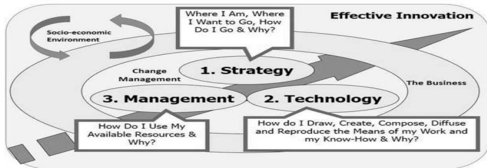
Figure 2. The evolutionary core of business. Vlados, Katimertzopoulos & Blatsos, (2019)

Innovation can start from one point, focus on a functional area with a distinct focus, but every innovation necessitates, at all times, combined repositioning and adjustments for the entire organization (Vlados and Katimertzopoulos, 2019; Vlados, Katimertzopoulos and Blatsos, 2019):