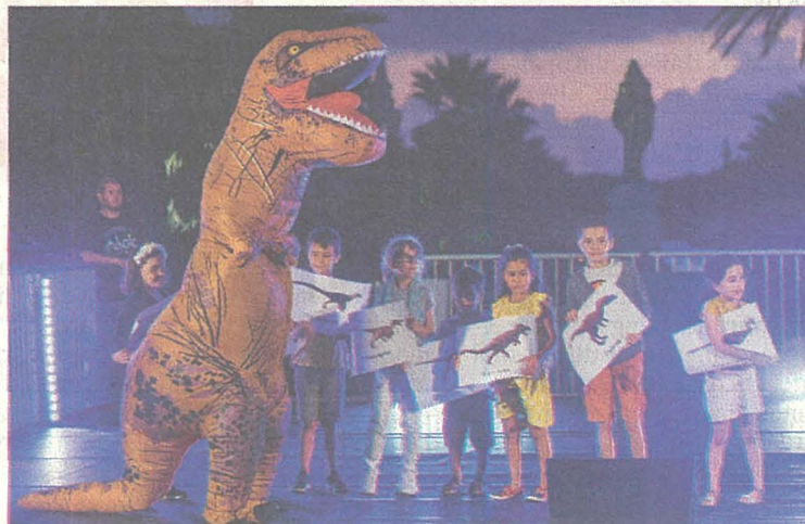
The event is part of the EU-wide celebration, European Researchers' Night.

Centred on the theme Engage, Empower, Enable, this year's attempts to deal with the virus has resulted in an exciting new outlook for the festival. The festival will be a hybrid. Most of the activities held in Valletta will also be digitised allowing the festival to reach new online audiences. The event endeavours to engage its audience innovatively with science and the arts, in an attempt to empower citizens with creative thinking skills and enable them to become free thinking active citizens. The event, part of the EU-wide celebration, European Researchers' Night, funded by the Marie Skłodowska-Curie Actions of the EU's H2020 programme, has been recognised as an excellent festival by Europe for Festivals