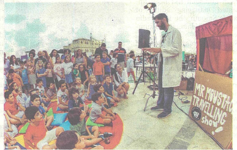
The ninth edition of Science in the City will host over 30 activities.