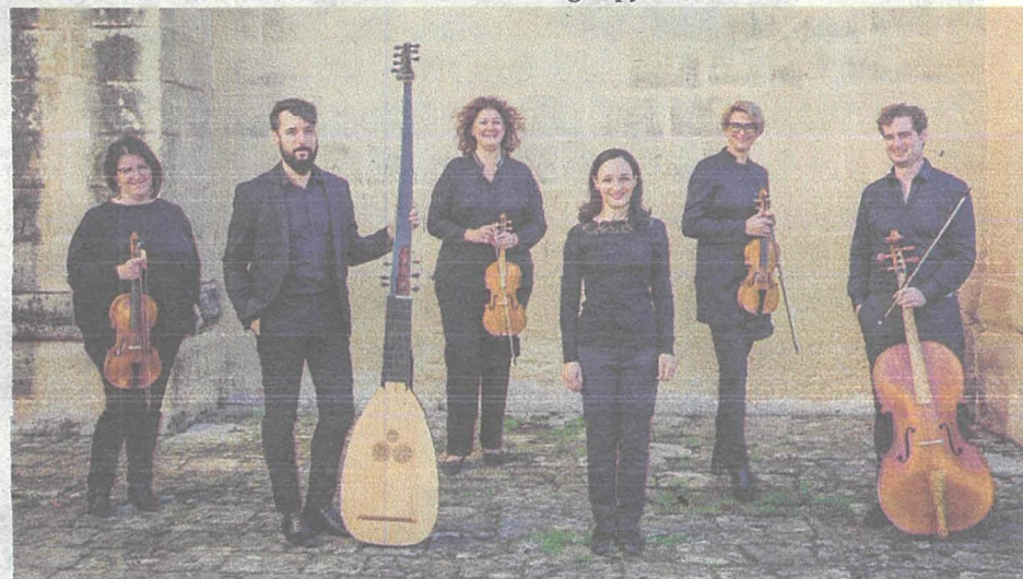
ViBE Christmas Concert.

three to five the adventures of Emme, a baby merrill (blue rock thrush) that is bright and cheerful, but not always obedient.