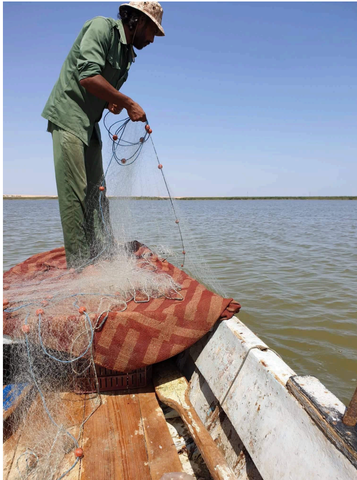
Figure 1. Small-scale deployment of trammel and gill nets at the Umm-Hufayn lagoon, eastern Libyan coast.

Along with the white shrimp Penaeus setiferus (Linnaeus, 1767) and the pink shrimp ( Penaeus duorarum (Burkenroad, 1939)), P. aztecus represents one of the three most important commercial fisheries in its native region in the Gulf of Mexico. These fisheries, which are based on the premise that all individuals spawn, grow, reproduce and die within one year (NOAA 1992), are considered to be in a state of complete exploitation (O'Connor and Matlock 2005). Spawning of P. aztecus occurs offshore, after which post-larval stages are carried passively by advection to estuaries, where they develop into sub-adults which migrate offshore to spawn (NOAA 1992).