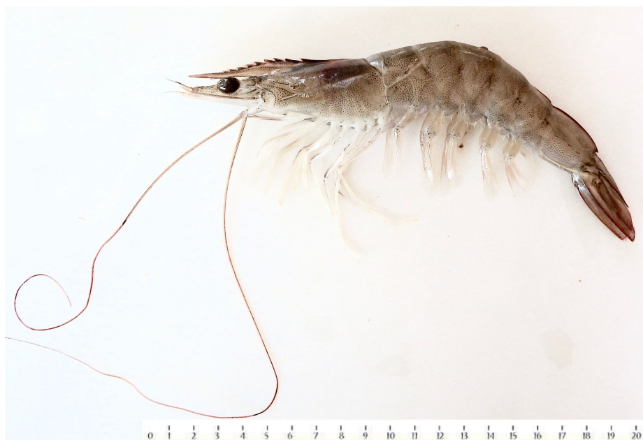
Figure 3. A specimen of Penaeus aztecus recorded in the Umm-Hufayn lagoon. Scale is in cm.