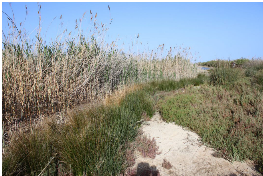
Figure 2. The banks of Umm-Hufayn lagoon support halophytic vegetation dominated by Salicornia fruticosa (L.) L., Juncus acutus L. and Phragmites australis (Cav.) Trin. ex Steud.

(coordinates: 32°33'13.5"N, 23°05'57.2"E), situated within the Gulf of Bomba along the Libyan Cyrenaica coast, approximately 50 km south-east of the city of Derna.