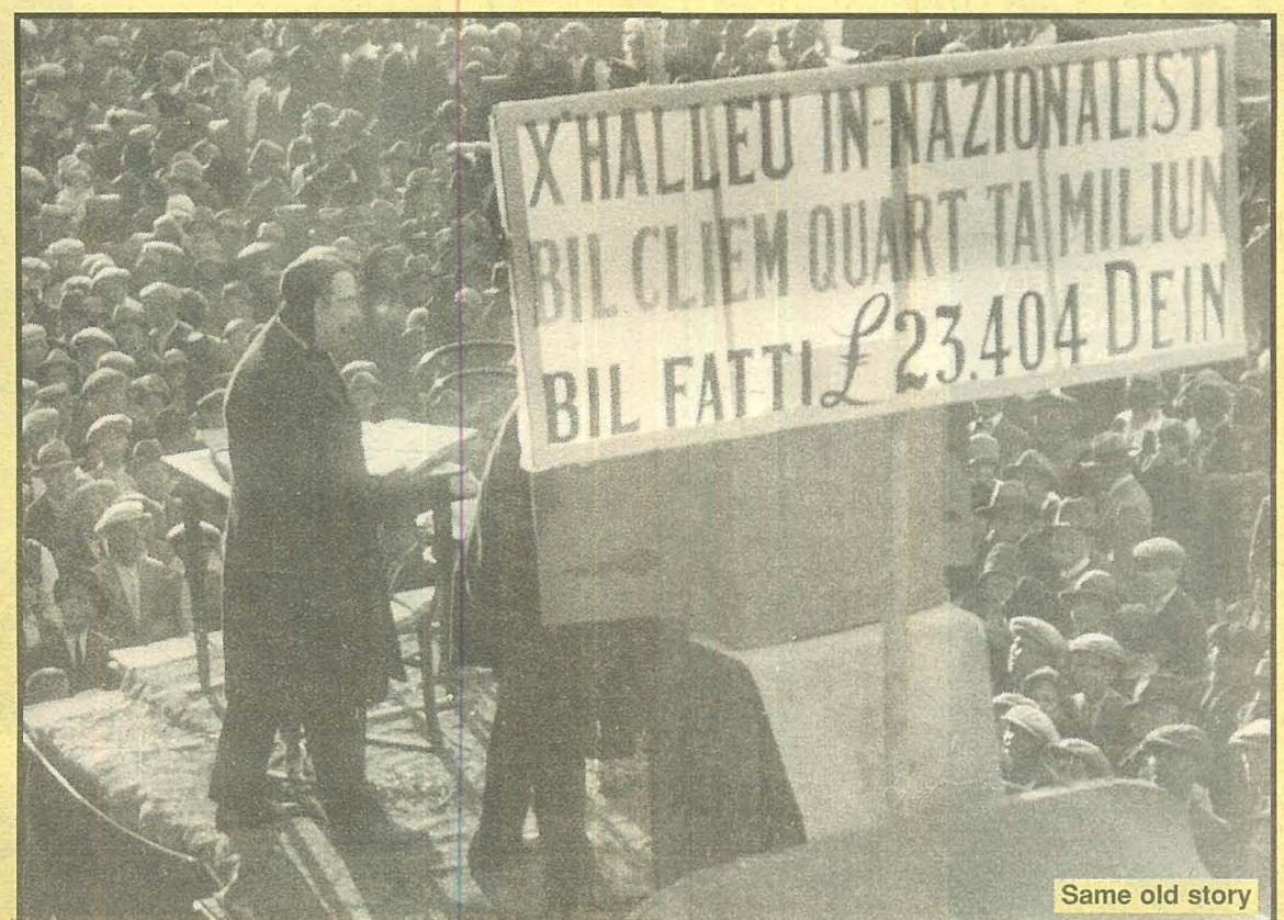
Same old story