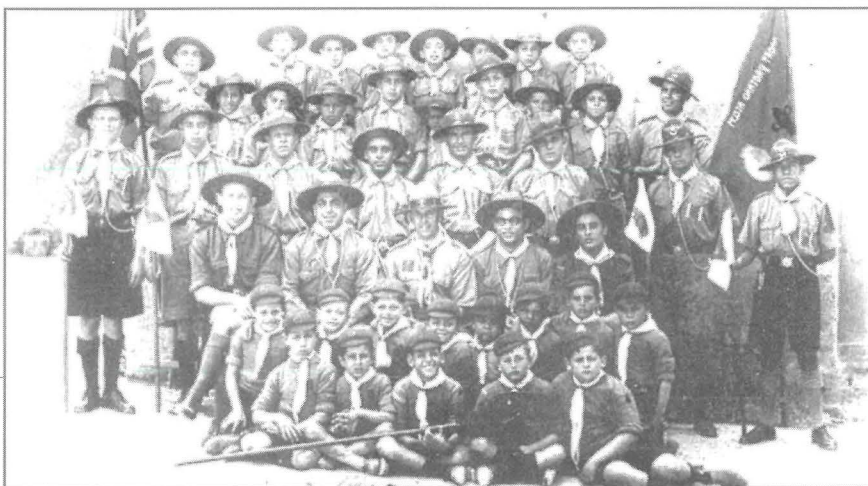
Il-Musta Oratory Troop, ritratt ta' l-1933

Allied Forces H.Q. Constantinople, A.B.S. 29th Nov., 1919