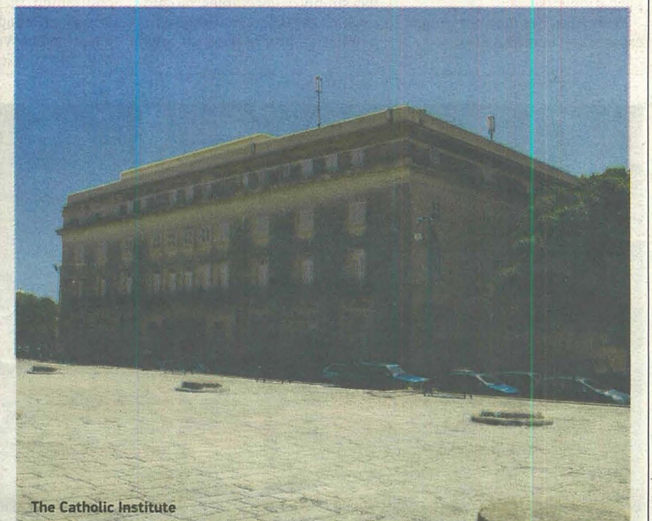
The Catholic Institute