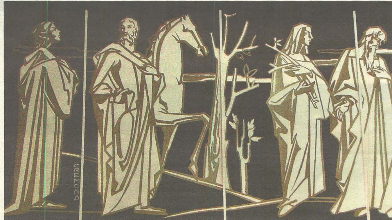
The Emvin Cremona panels, representing episodes from the Bible story of St Paul's Shipwreck, before the restoration.