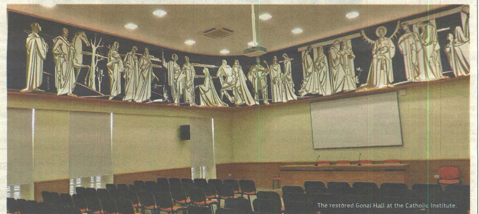
The restored Gonzi Hall at the Catholic Institute.