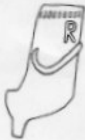
Figure 1 Saffieni 18/17

"It is interesting to see the RAOB pipes from Malta. One might have thought that these would be confined to areas with RAOB Lodges - or perhaps there were some in Malta? Otherwise they must have been a popular design, widely available and not for a 'specialist' market. They are certainly common in early 20th century contexts in UK, which would tie in with the 1909 excavation backfill. They were widely produced and could have come from anywhere in England (I don't think they were much produced in Scotland)". The RAOB (Royal Antedeluvian Order of Buffaloes) were, and probably still are, a society who meet both for social enjoyment and mutual assistance. Very probably there would have been at least one Lodge in Malta during British times.