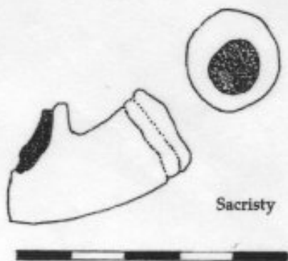
Figure 3 (left) A pipe fragment was also found beneath the sacristy of the Citadel Cathedral, Gozo.