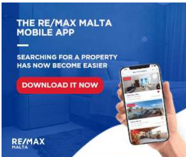
More property in St Julian's