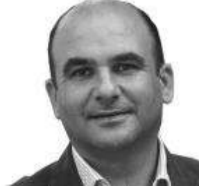
Lack of consultation risks