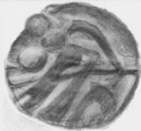
VLG 2011 maker's mark?

There are other instances of monogrammed pipes in Maltese collections, i.e. Ca1 from the old sewer system at the Auberge de Castille which has the 'bird' stamp of Varna, Bulgaria, unpublished. MP21 and MP22 with Arabic characters. 4 QH48, QH104 and QH199 from a 2001 excavation in the quarantine harbour. 5 Similar stamps to that on QH48 also occur on 18 th century pipes from Jerusalem. 6