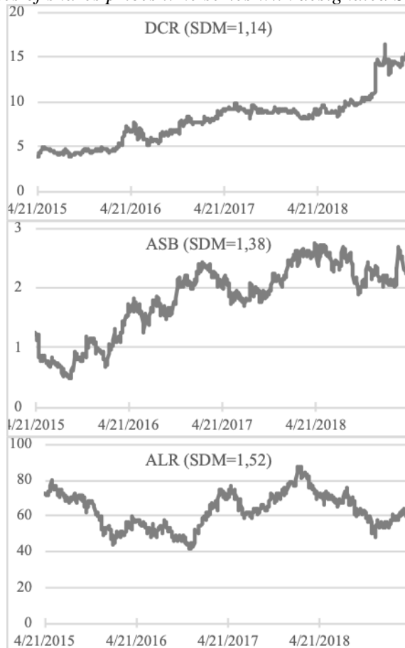
Figure 3. Examples of shares prices time series with designated SDM measure