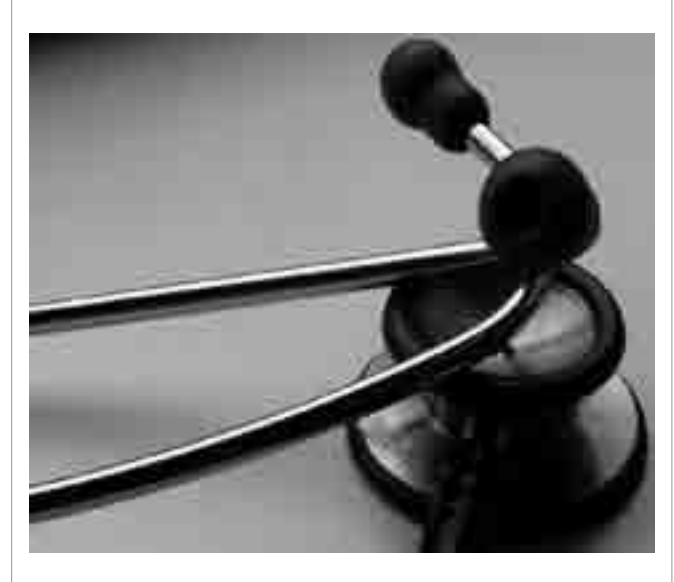
Figure 3: An acoustic binaural stethoscope

also been falling but electronic stethoscopes are still nowadays more expensive than a good acoustic model.