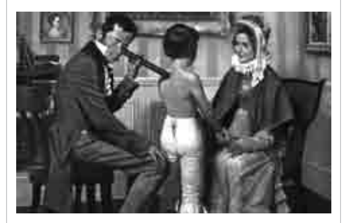
Figure 2: Laënnec auscultating a child's back with his stethoscope

Electronic stethoscopes have been available for quite some time, but these devices per se have generally provided only a minimum level of improvement over their mechanical predecessors. Other disadvantages include their expensive retail price, the frequent complaint of 'background noise', and that although described as 'electronic', most of the devices cannot interface with computers; but with the recent advancements in technology, these limitations are rapidly decreasing. Costs have