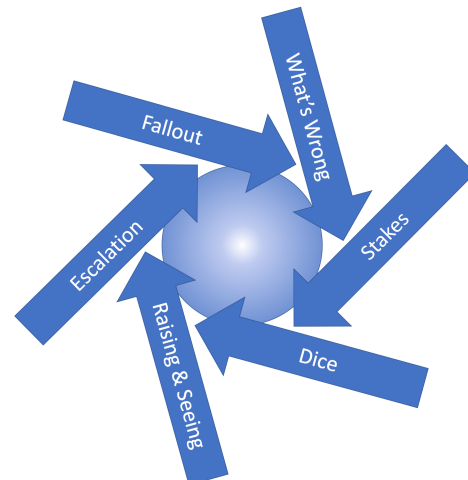
Figure 2: A fruitful void diagram of the tabletop game Dogs in the Vineyard , showing how mechanics feed into one another to keep play “in orbit” around an unsystematized central theme. Figure based on a figure from [7].

Expressive Range was more directly applied in the development of the game That’s Me TV by Matthew Guzdial [20]. Given his