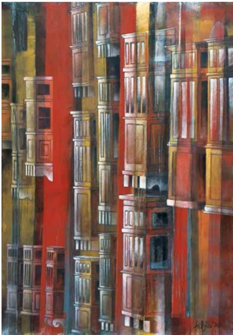
Maltese Balconies in Valletta - no one out! , (2020)