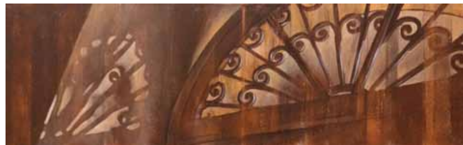
Maltese balconies in Valletta , (2019)