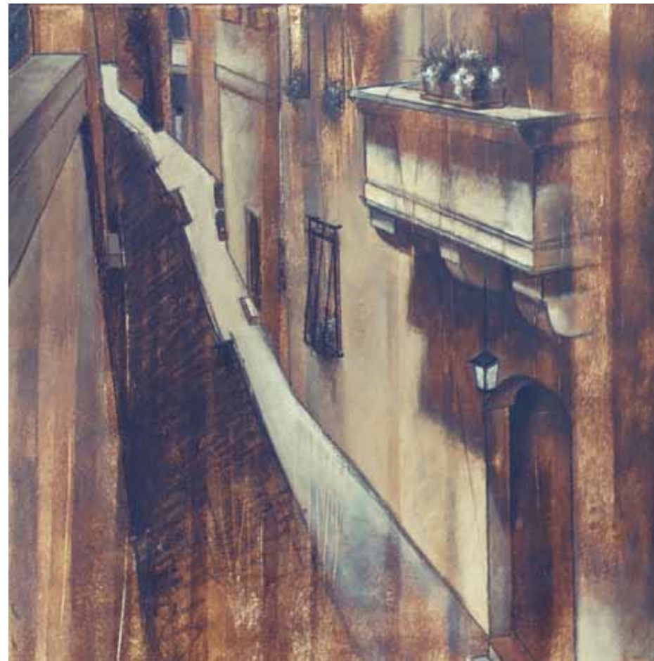
Looking from my window, (2020)