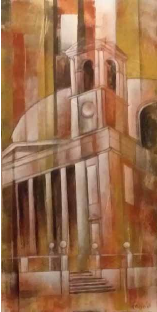
Mosta Church, (2019)