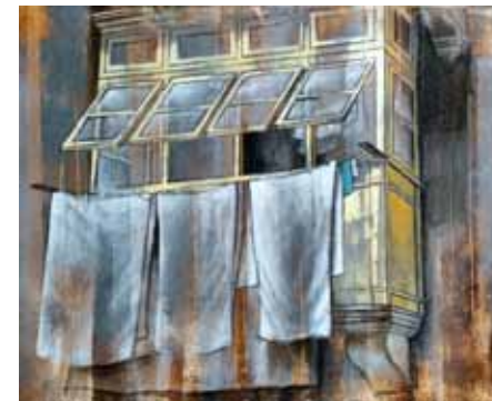
Hanging out clothes outside, (2020)