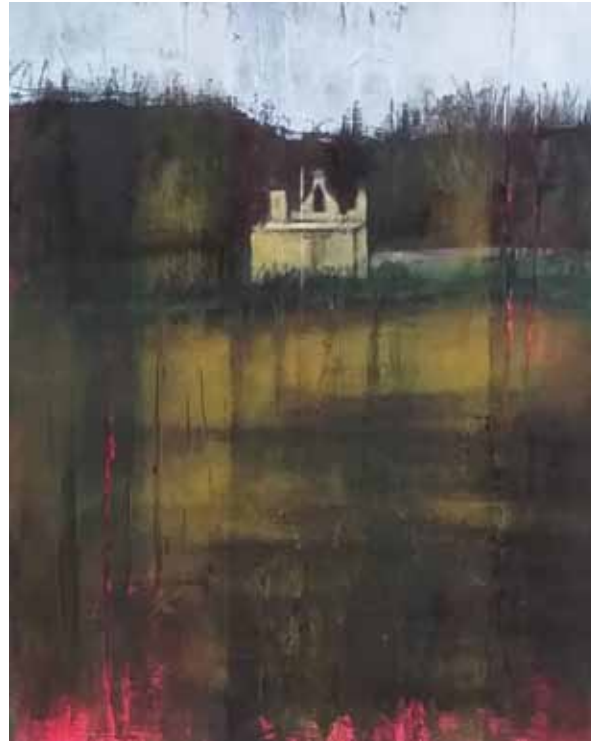
San Pawl tal-Qliegħa Chapel, Mosta , (2019) Acrylics on canvas 30x42cm