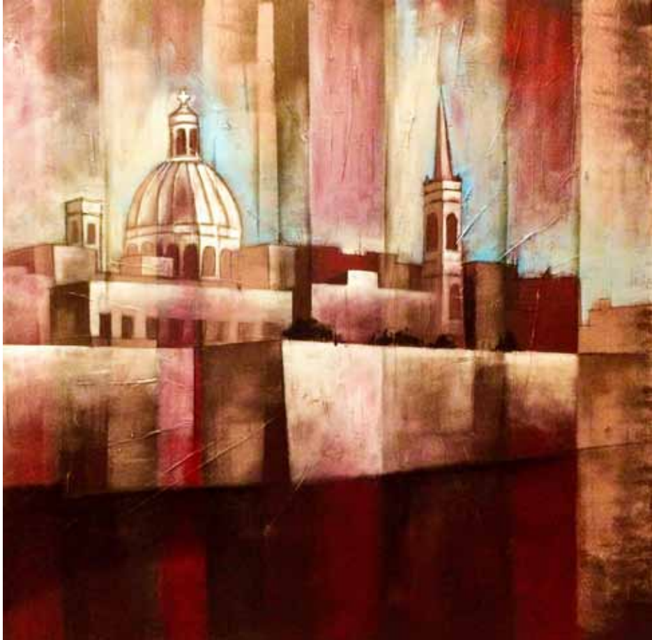
Valletta Skyline, (2019)