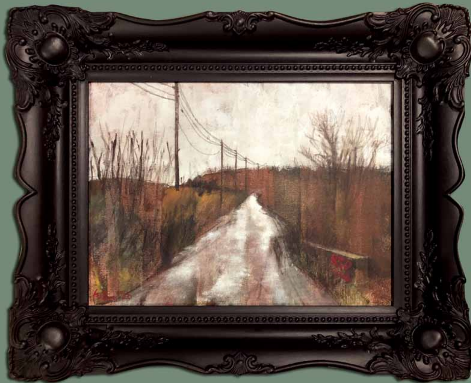
R T O - No Entry, (2020)