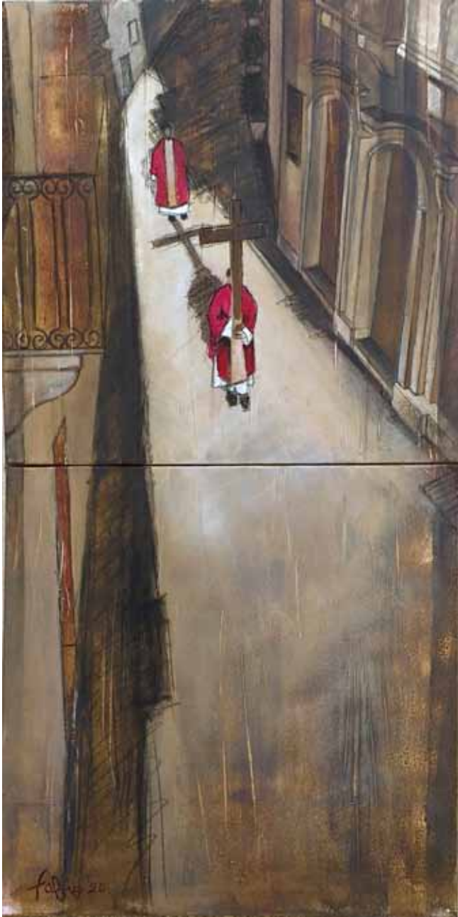
Good Friday procession in Birgu, during the pandemic, (2020) (in Hilda Tabone Street)