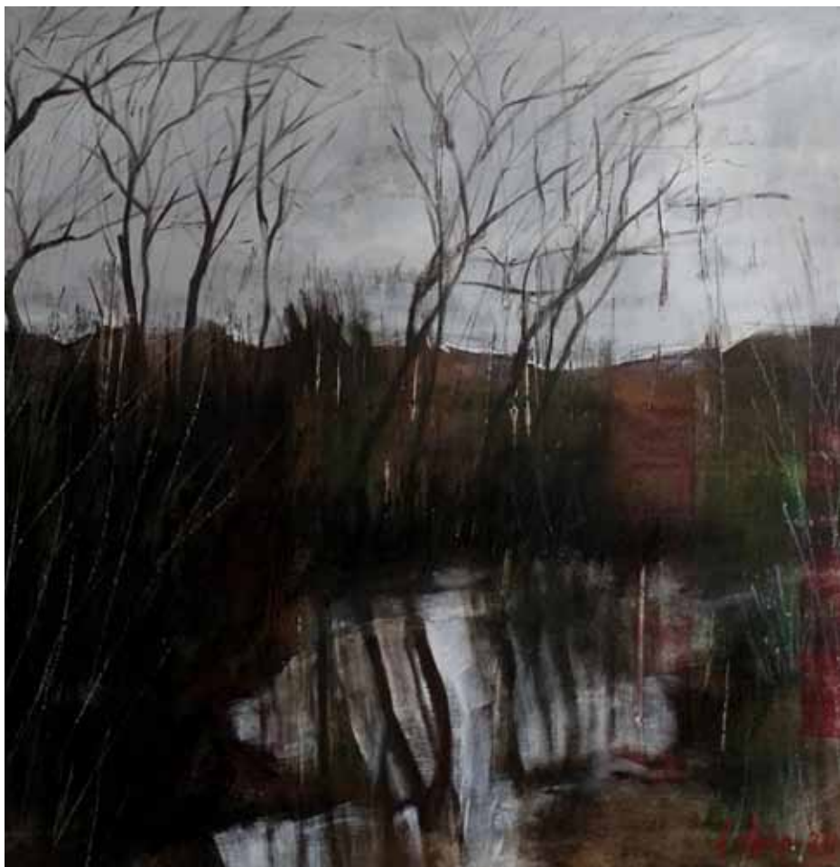
Winter in Wied il-Fiddien, (2020)