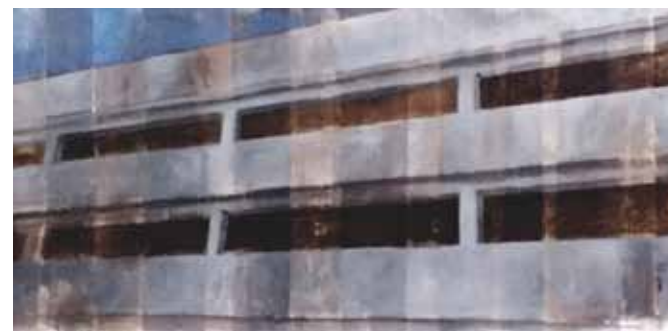
Irregular Constructs, (2020)