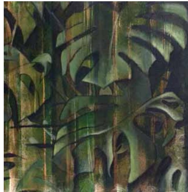
Cheese Plant, (2020)