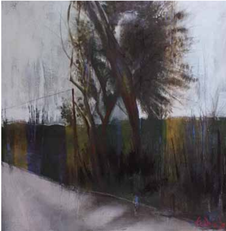
On the way to Buskett , (2020) Acrylics on canvas 50cm x 50cm