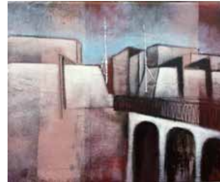
Valletta City Gate, (2019)