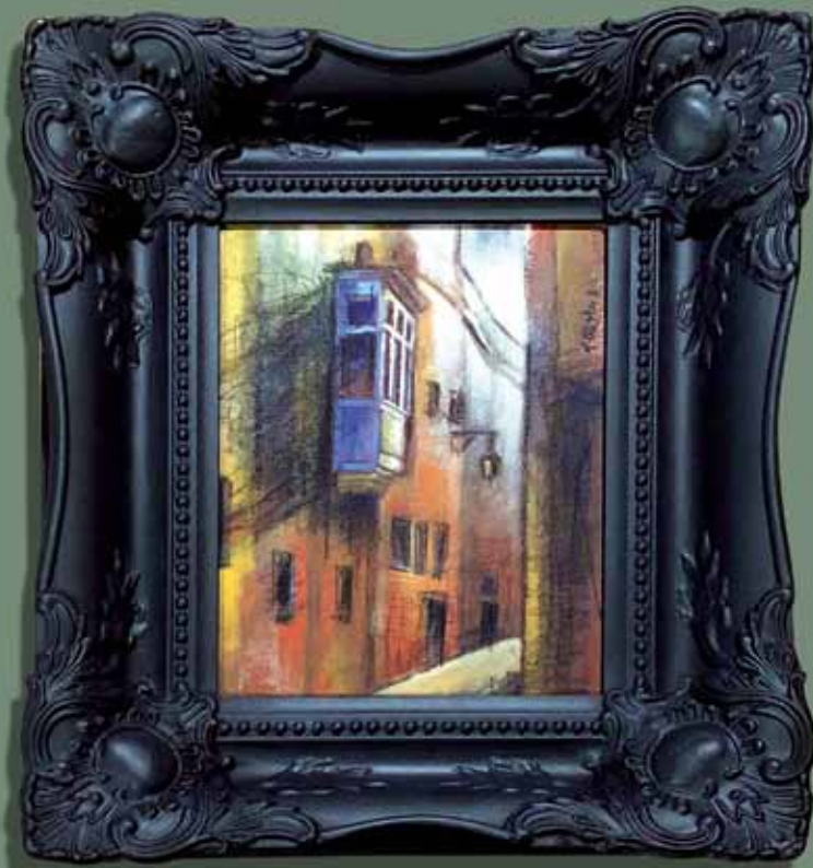
The Silent City , (2020)