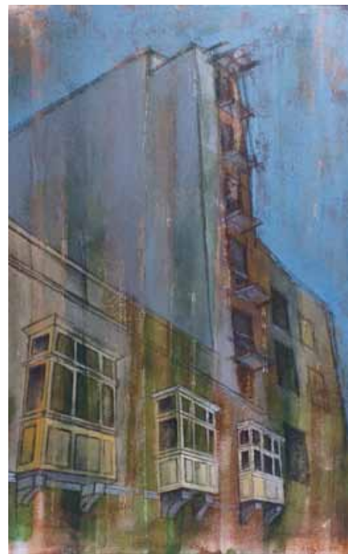
We are destroying our Heritage, (2020)