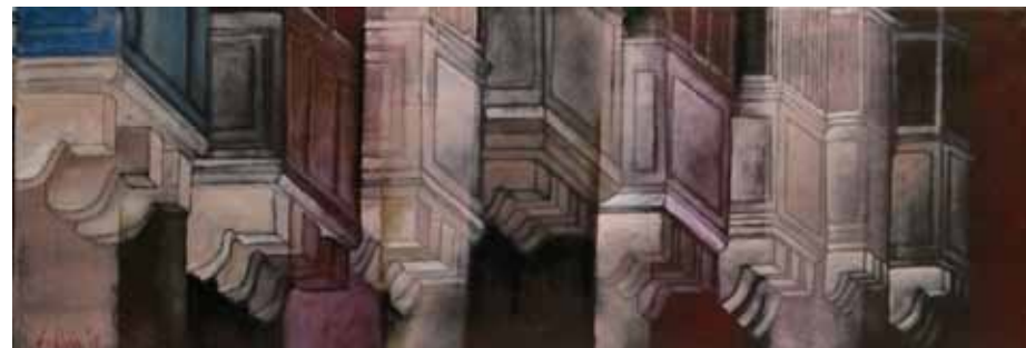
Maltese Balconies , (2020)