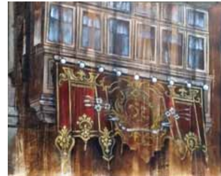
Balcony decorated for the village feast, (2020)