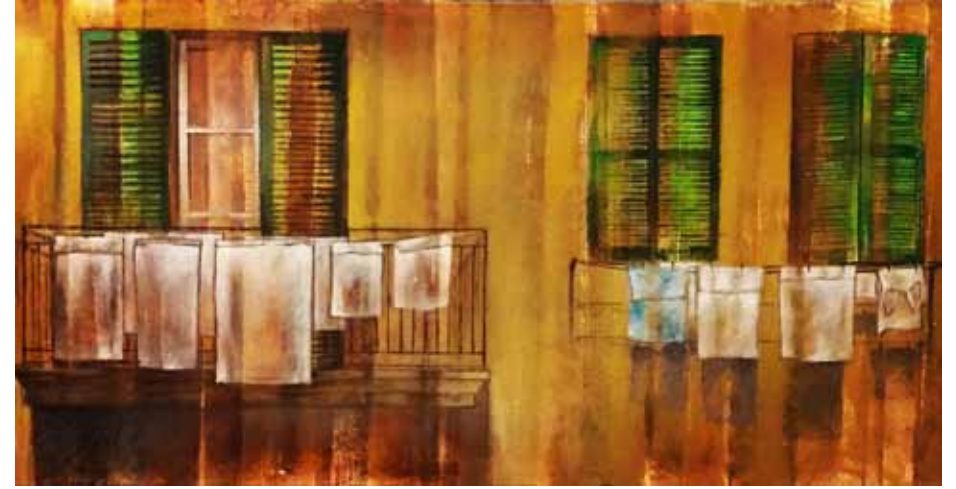
White clothes hanging on traditional balcony, (2020)