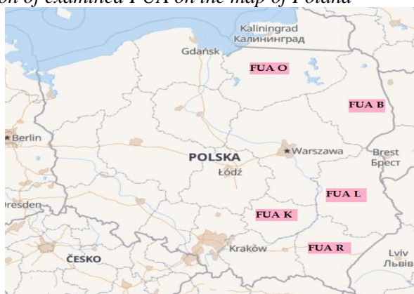
Figure 1. Location of examined FUA on the map of Poland