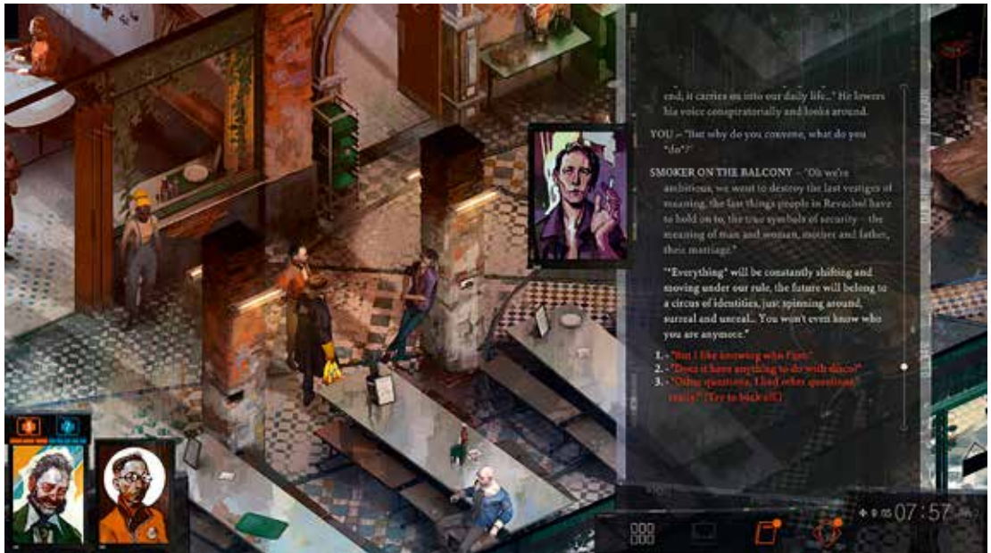
FIGURE 1. Caption: "You won't even know who you are anymore" – the dissolution of identity constructions