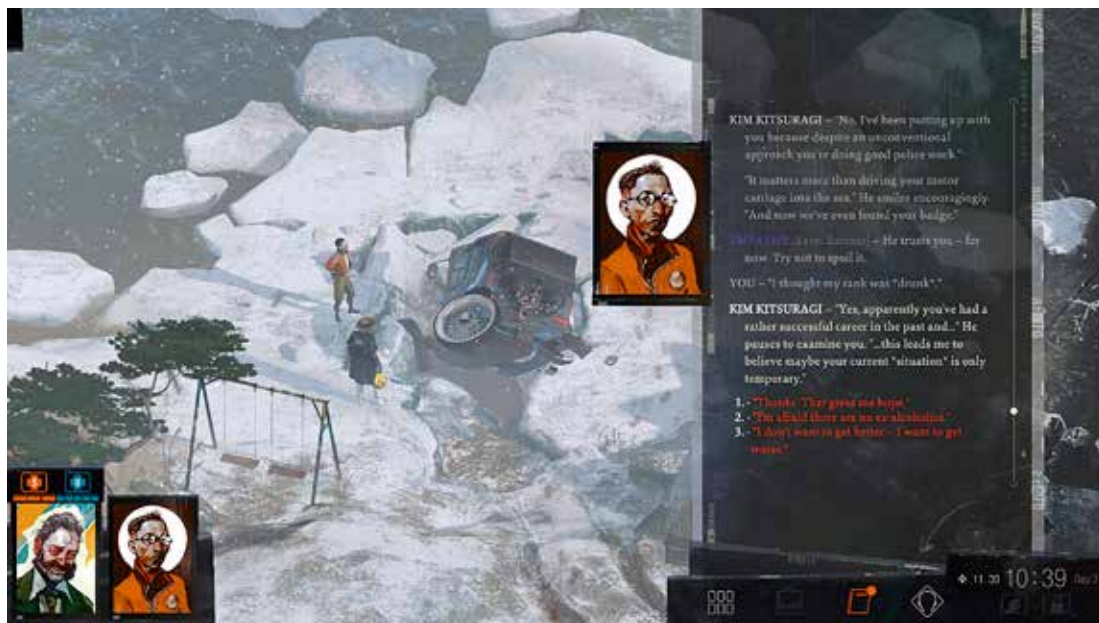
FIGURE 2. Caption: Ambiguity as to the attribution of the protagonist's words. FIGURE 3. Caption: The possibility of a return to the authoritative subject – and its undermining.