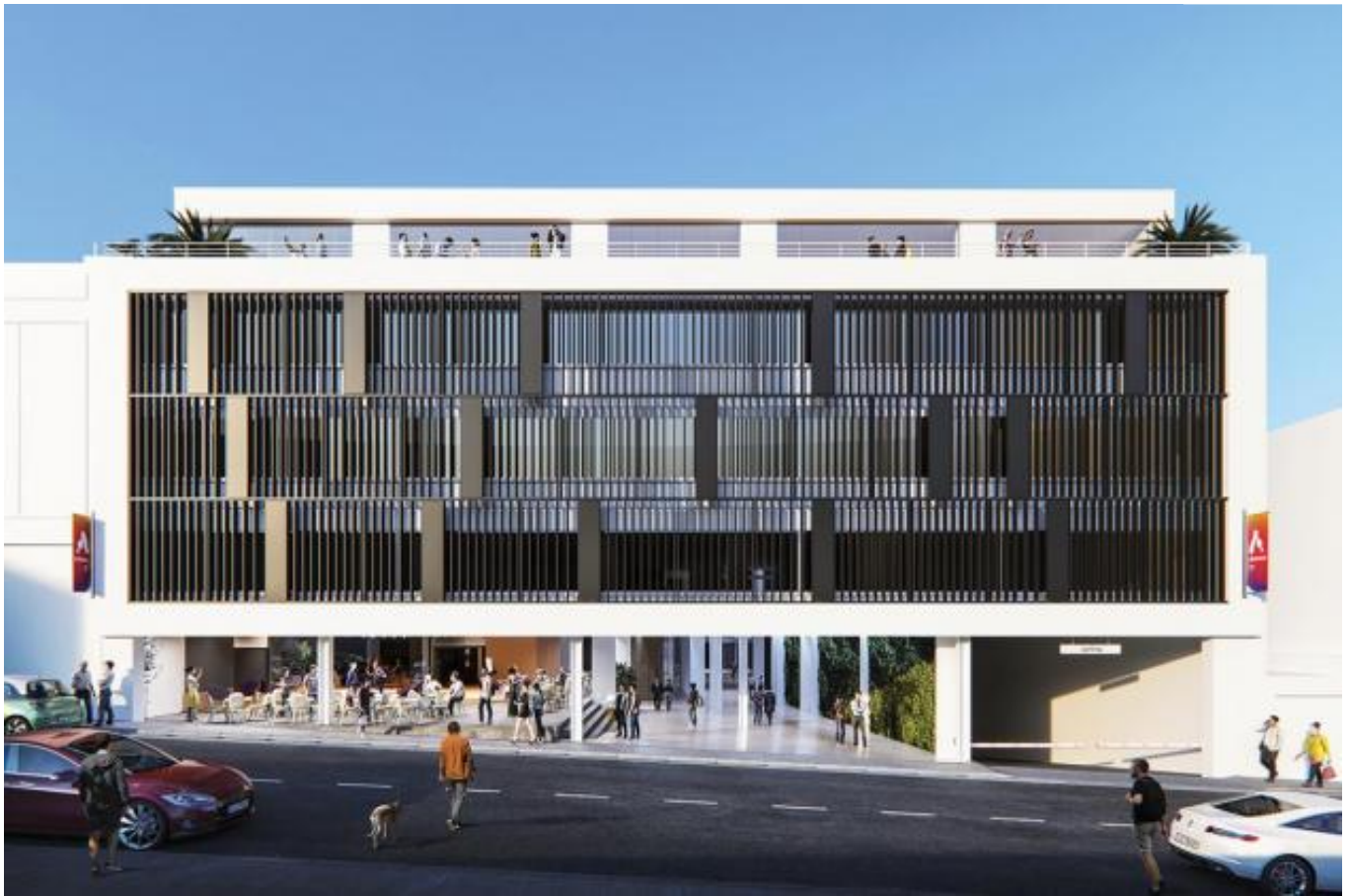
Avenue 77 - A new kind of workplace