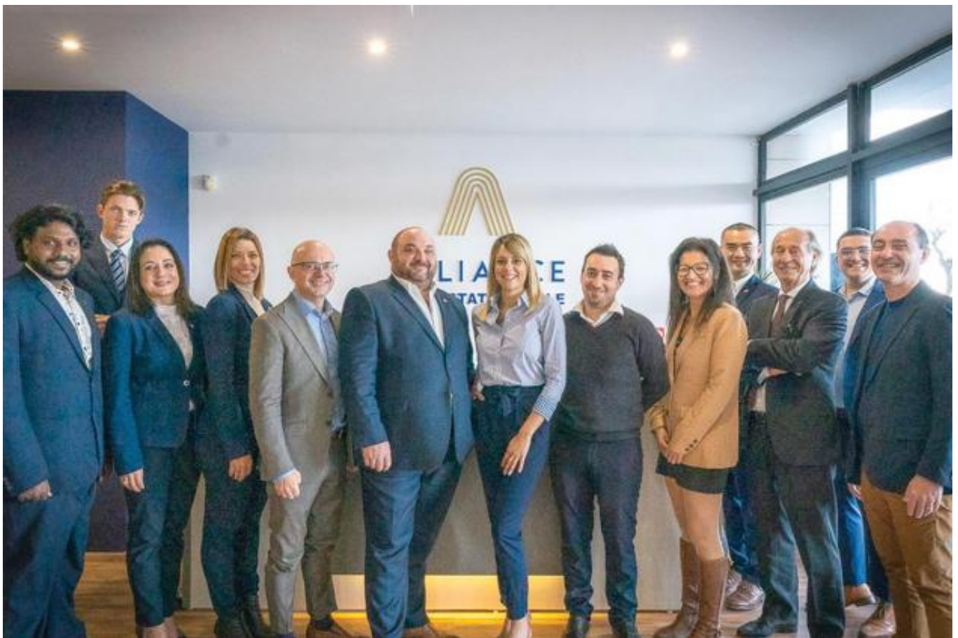
Alliance Real Estate: Innovating Malta's letting market