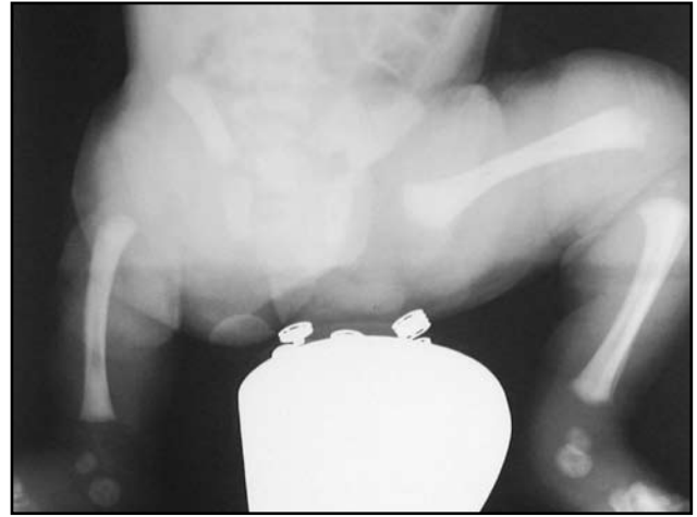
Figure 2: X-ray of both lower limbs – femur, fibula and acetabulum are absent on the right side (consent to use this photograph was given by the parents)