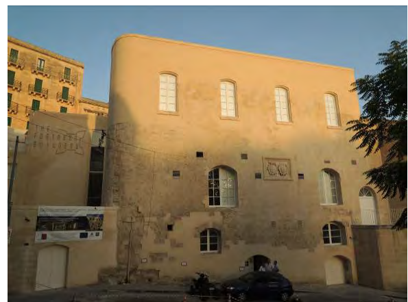
Figure 3 (left): the façade on St. Mark's Street before restoration and Figure 4 (right): after restoration

The project was divided in two main phases, that dealing with the restoration and civil works and that with the finishing and furnishing of the building. The first phase was carried out in the months between the end of 2009 and February 2011. The second phase was started in December 2011, and completed in July 2012. The civil and restoration works saw the reconstruction of the second floor, the connection between the two halls at ground floor and the new construction of a new block, adjacent to the historical building that would connect the three levels together. Directly following this stage, the restoration of the exterior masonry fabric was undertaken. The stone was cleaned from surface debris with nylon brushes and vegetation removed following the use of an approved biocide/herbicide. The cement present was carefully removed using handheld tools and paying special attention to the stone underneath. The joints which were unsound or composed of unsuitable materials like cement were raked out and re-pointed using a mix based on hydraulic lime. Where stones were heavily deteriorated or missing, these were replaced with new stone of the same type retaining all original course heights. Stones which were damaged but still intact were repaired using plastic repair techniques using lime based mixes.