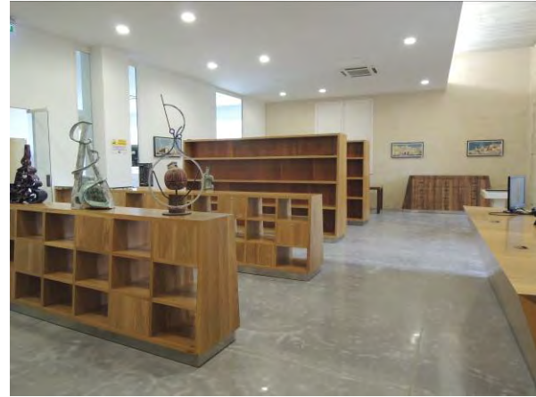
Figure 9 (left): exhibition hall at first floor and Figure 10 (right): the library