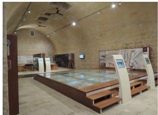
Figure 7 (left): hall at first floor before restoration and Figure 8 (right): after restoration

The Centre also has a dedicated lecture theatre designed to accommodate 50 visitors. Specially produced feature presentations will be projected here introducing audiences to the various aspects of the subject. The lecture hall will also be used to host an ongoing programme of lectures on all aspects related to the study of military architecture and the conservation of fortifications. A small souvenir shop complements the centre with a small outlet at second floor. The tour culminates on St. Andrew's Bastion which houses a small cafeteria/kiosk and affords spectacular views of the fortifications from the restored/rebuilt banquette. A public lift which functions separately from the centre was inserted into the newly built annexe block. This allows the public to avoid taking the Biaigo Steps to access Melita Street from St Marks' Street by taking the lift. The lobby to the lift also serves as a mini exhibition intended to attract the public to visiting the centre.