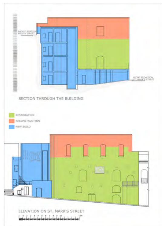
Figure 1 (left): location plan and Figure 2 (right): section and elevation of the building