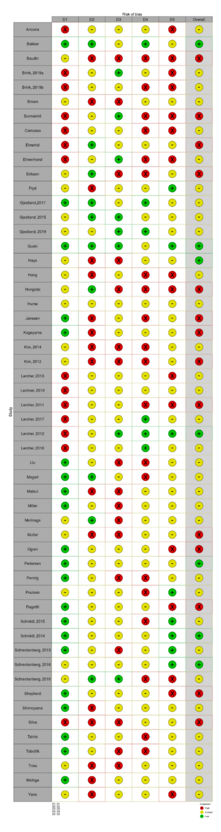
Figure A1. Risk of bias.