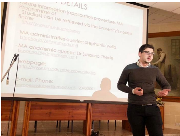
Presentation during the Gozo Seminar