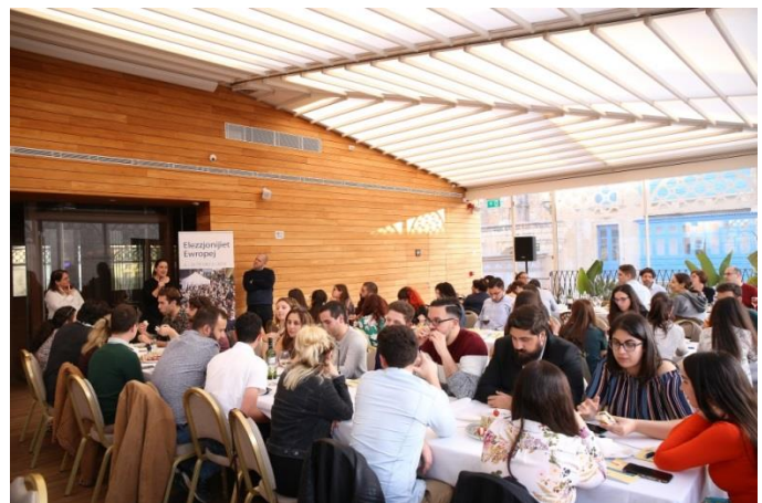
Photos from the event