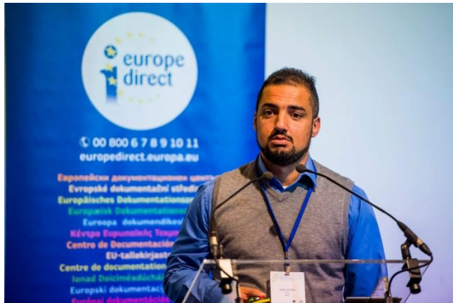
The EDC Manager during the presentation