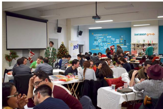
The Quizmas event

EDIC University sponsored JEF Malta's christmas themed quiz open to all University students. EU-related questions featured as part of the activity.