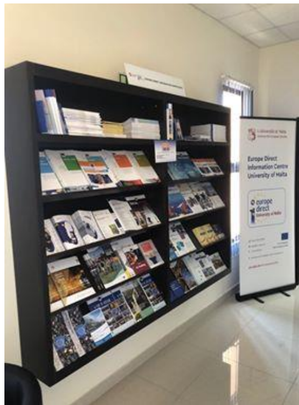
The EDIC Walk-In Centre on campus