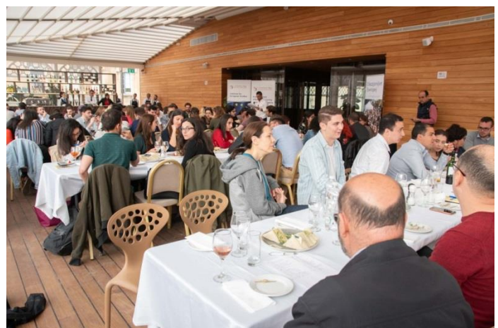
Photos from the event