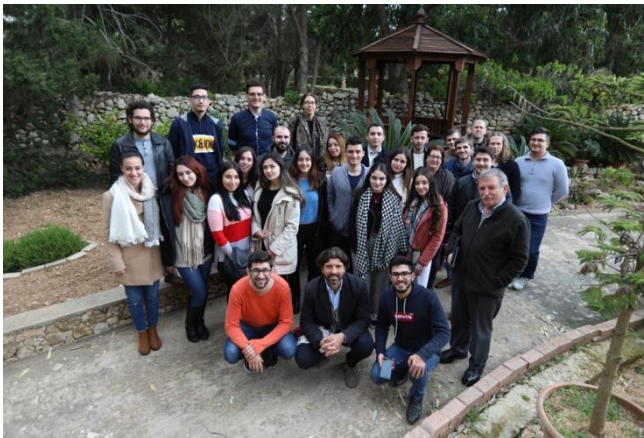
Group photo of participants in Gozo Seminar

The dissertation seminar for final year Bachelor of European Studies students was held at Manresa House in Gozo on 19 and 20 February 2019. This annual seminar has been organised by the Institute for European Studies since 2010 and has become an integral part of the calendar of the Institute's final year undergraduate degree programme. It provides an opportunity for students to present their work on the dissertation and to obtain feedback from the Institute's academic staff as well as their fellow students. As in previous years, students found the experience positive and the feedback given to them to be very useful. As in the previous year, some commented that it would be more useful if the seminar was to be offered earlier in the course, but overall, as in previous years, students continue to recommend the seminar.