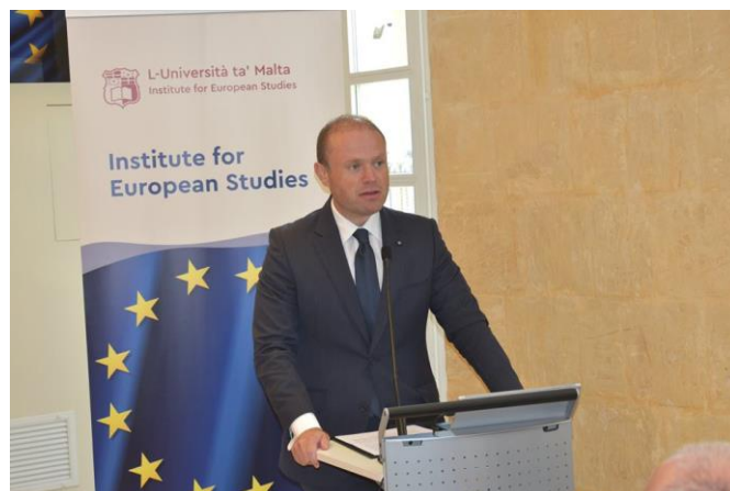
The Prime Minister addressing the book launch