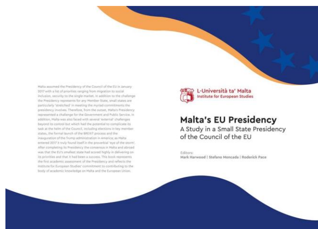
The book cover as published