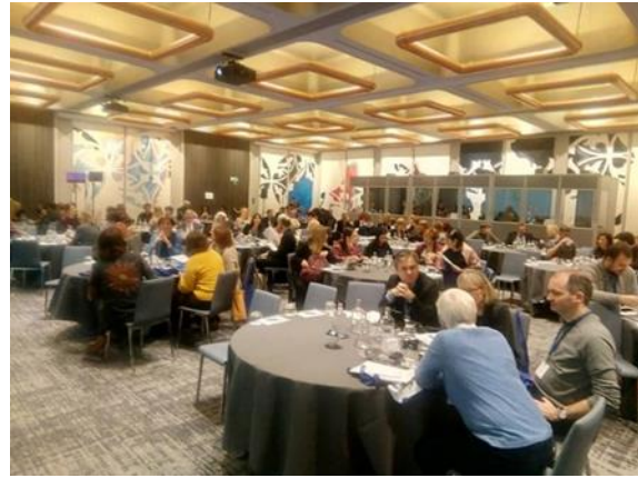
EDC Managers during the group work

EDCs were also encouraged to make use of the resources offered by the Publications Office and the EC library. The Publications Office offers around 150 different services and covers all EU institutions. EDCs have a privileged user access enabling them to order all publications for free and in bulk numbers. The EC library has become more users friendly and the open access filter has been added in its search engine.