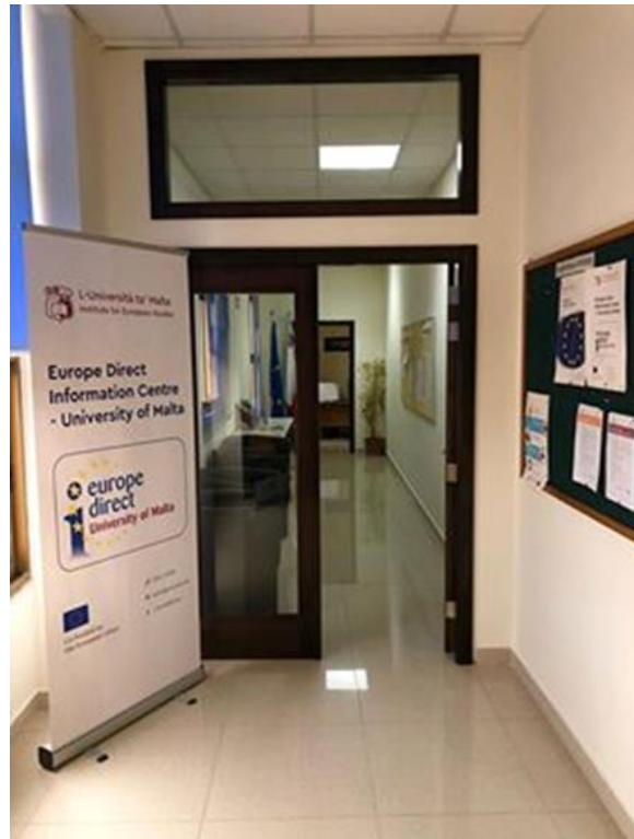
The EDIC Walk-In Centre on campus