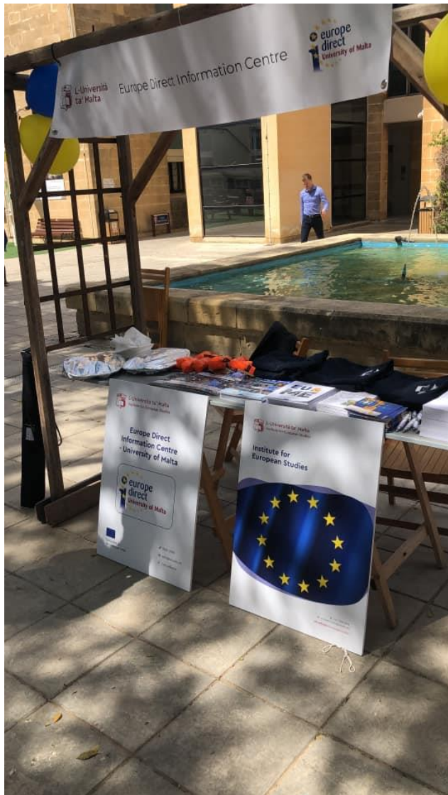
The IES and EDIC stand on campus

EDIC University (together with the Institute for European Studies) set up an informational stand at the quadrangle of the main campus during which it distributed material on the EU. EDIC University also sponsored JEF Malta's Vino e Vino event which is held every year in the evening of Europe Day.