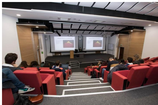
The audience during the lecture