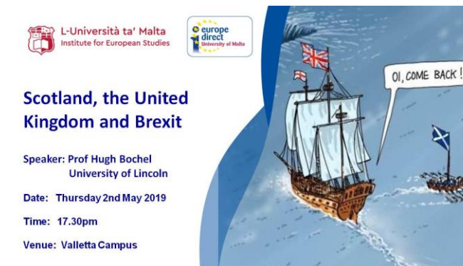
Poster of the event

for the relationship between Scotland and the rest of the UK, and indeed for the future of Scotland.