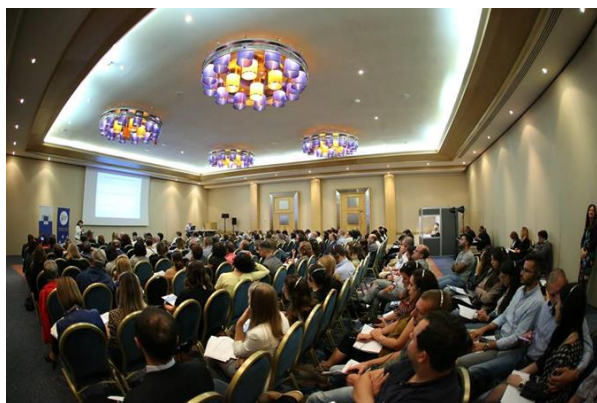
The audience at the event

Then, on 15 March 2019, a group of 47 Maltese citizens joined citizens from Trapani, Palermo, Agrigento and Pantelleria for the third and final transnational dialogue on the Future of Europe.