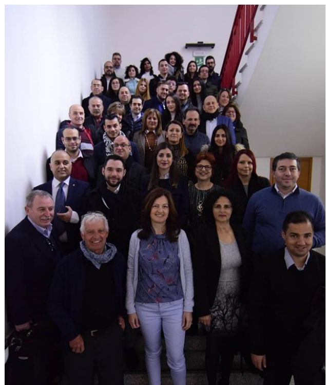
The Maltese participants