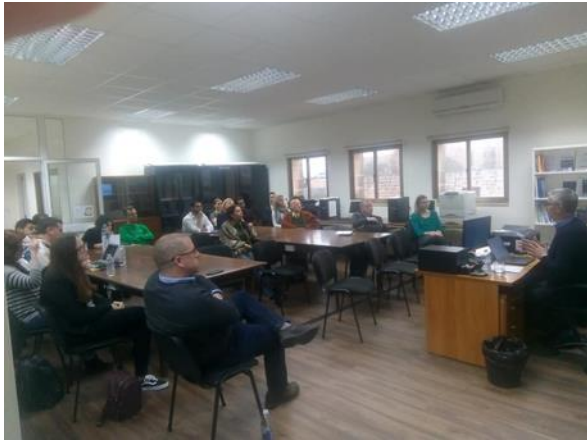
The audience during the talk