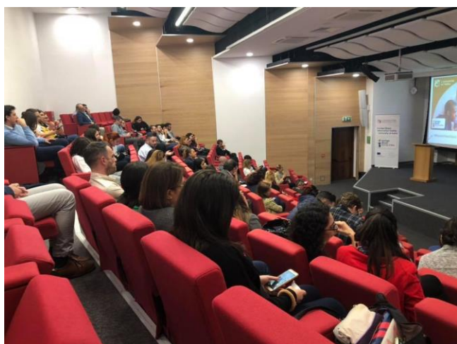
Members of the audience during the event

This was the first seminar organised by the University of Malta to celebrate and raise awareness on the importance of vocational education. The Faculty of Education is the foremost teacher education institution in Malta and has recently introduced a Master's in Teaching and Learning in different areas of Vocational Education, both on a part-time and full-time basis.