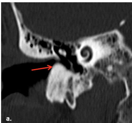
Figure 2. Coronal reformats again demonstrating bilateral osseous outgrowths (arrows) within the external auditory canal (a. Right and b. Left)

Patient presentation will vary depending on the severity of the exostosis present. They would typically present with complaints which occur secondary to the exostosis such as conductive hearing loss, fullness within the ear and otalgia. These symptoms may be the result of cerumen impaction, otitis externa or else rupture of the tympanic membrane. 1 Prior to the use of CT, the diagnosis and grading of exostosis relied on the patient symptomatology and otoscopic examination. 5 The otoscopic grading