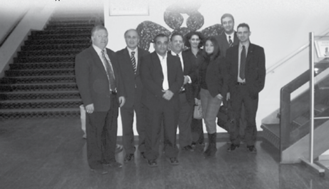
The Maltese delegation on a week-study visit to Cyprus in November 2006

One conclusion that could be drawn from this visit is that in both countries there is fine balance between optimism and pessimism. The new types of resources being tapped – particularly the intellectual and the technological – are the new routes being pursued to overcome the structural handicaps of peripherality and insularity that tend to accompany small island states.