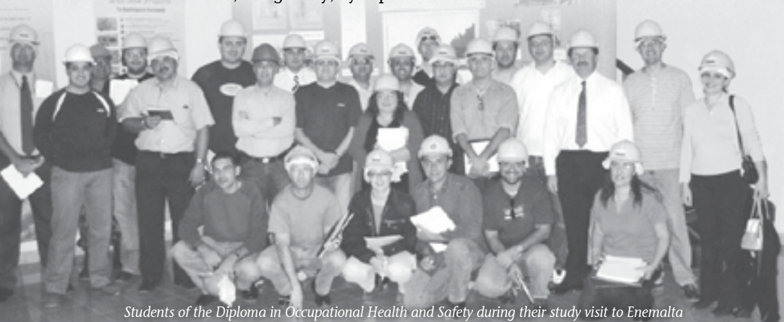
Students of the Diploma in Occupational Health and Safety during their study visit to Enemalta

Introduction, Familiarisation & Physical Science; People, Work, Industrial Relations & OHS; Business Management & Occupational Psychology; Epidemiology, Statistics & Research Methods; Elements of Toxicology & Management of First Aid; Occupational Safety Principles; Occupational Hygiene & Occupational Health; Health Promotion at Work & Ergonomics; Environmental Health Management & Supervisory Skills; The Legal Framework; Risk Assessment; Long Essay; Synoptic Examinations.