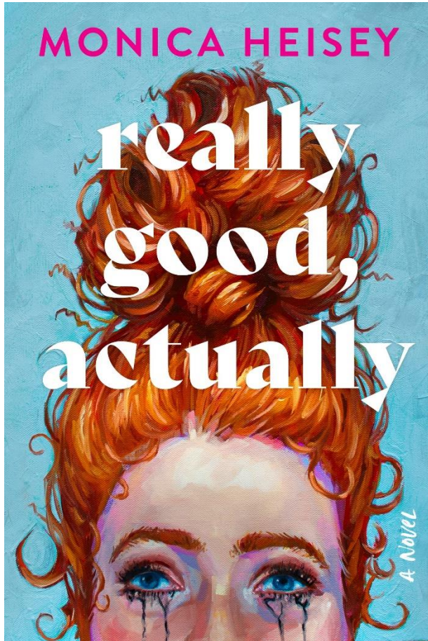
Figure 5: cover of the novel 'Really Good, Actually,'