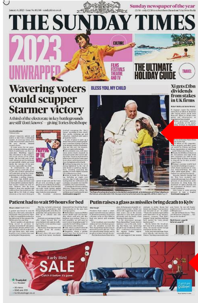
Figure 3: The Sunday Times Front Cover (January 2023)

a. Explain how the picture marked i. and the picture marked ii. are being used differently in The Sunday Times newspaper in Figure 3.