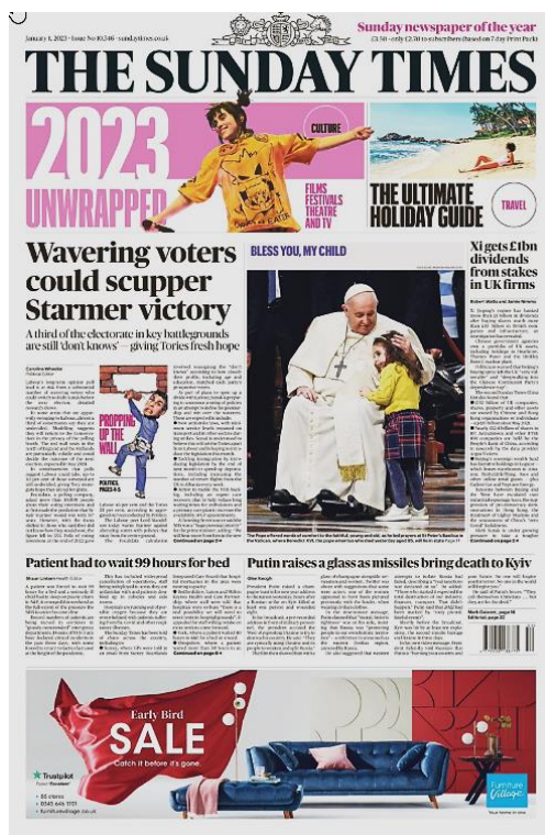
Figure 1: The Sunday Times Front Cover (January 2023)

c. Figure 1 shows the newspaper's front cover of The Sunday Times on January 1, 2023.