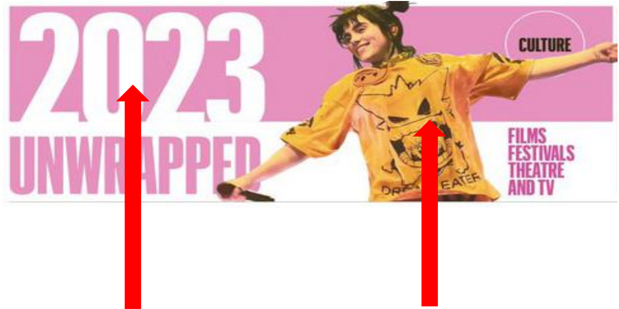
Figure 7: Graphic on The Sunday Times front cover (January 2023)

b. Identify the TWO graphic elements indicated by the arrows in Figure 7.