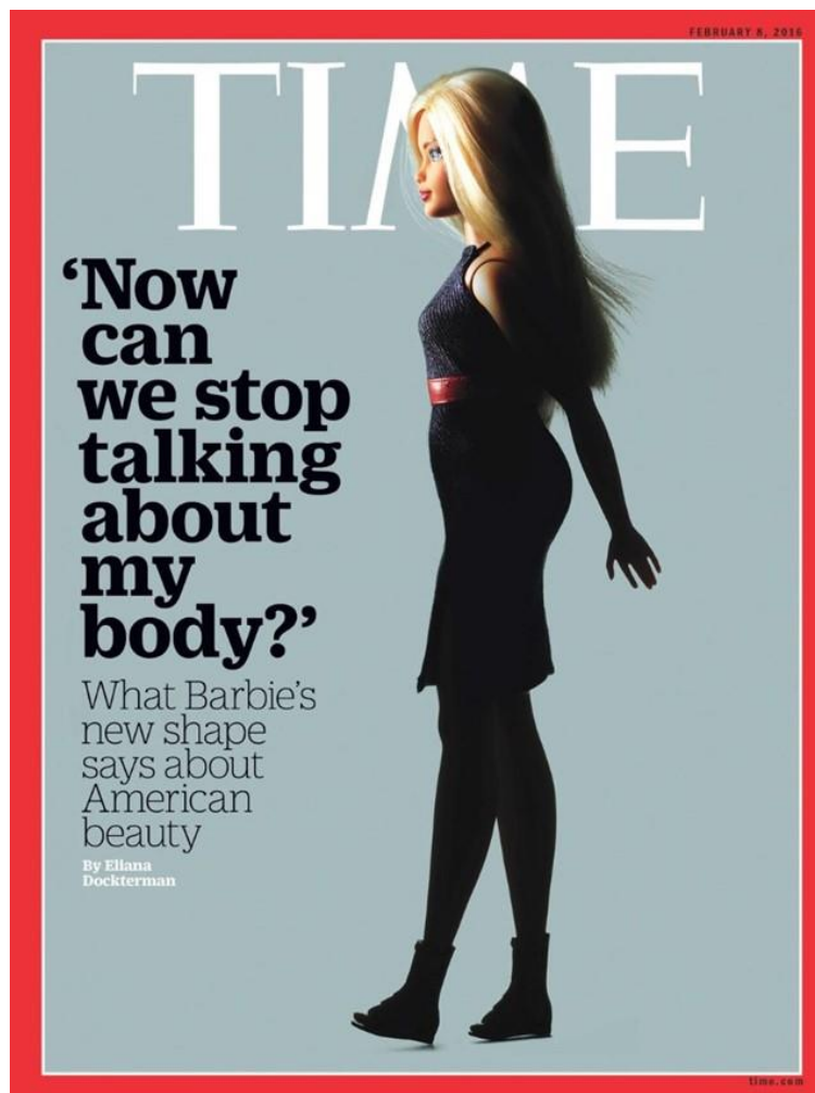
Figure 1: TIME magazine cover

Figure 1 is a TIME magazine cover for February 2016 featuring Barbie.