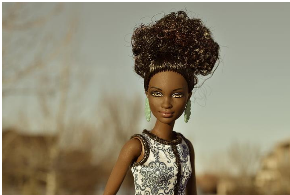
Figure 9: Barbie Doll