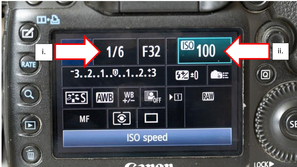
Figure 8: Canon Camera

The camera shown in Figure 8 has been set on a manual setting, as required to achieve high impact pictures.