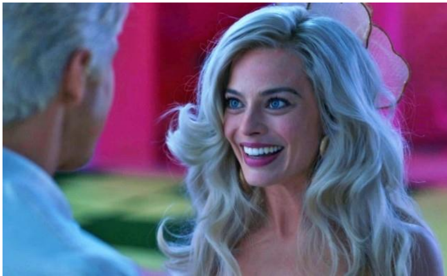
Figure 5: Photograph 1: Barbie

b. Identify the different types of shots used in the following photographs: