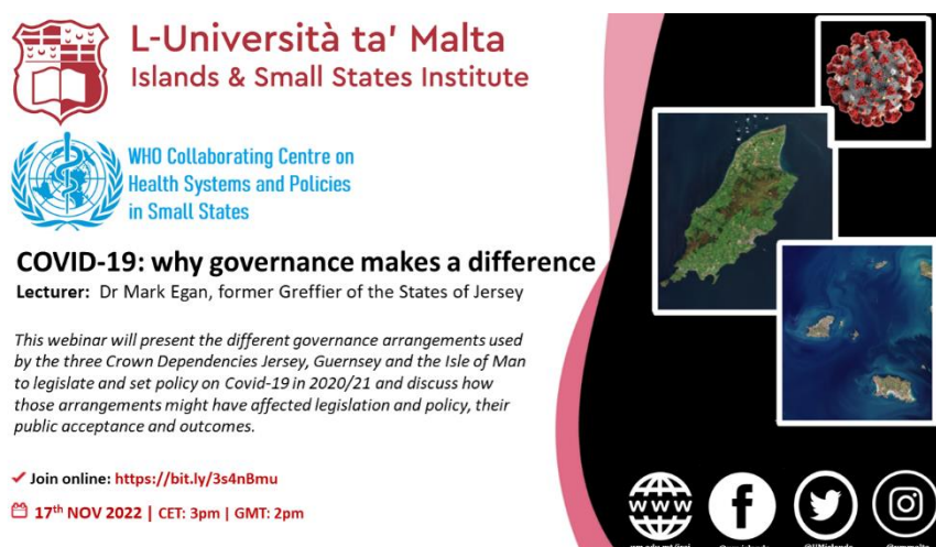
Picture 11. Poster for the webinar on "COVID-19: why governance makes a difference"