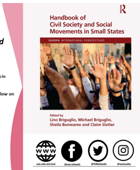
Picture 15. Poster for the first of three webinars launching the Handbook of Civil Society and Social Movements in Small States, published by Routledge