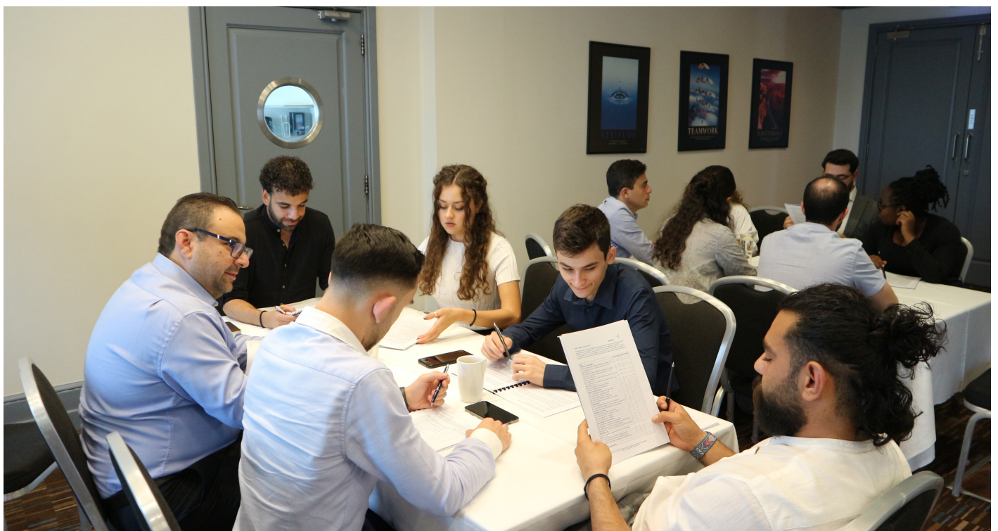
MEDAC students engaging in group discussions as part of the workshops conducted during the seminar.