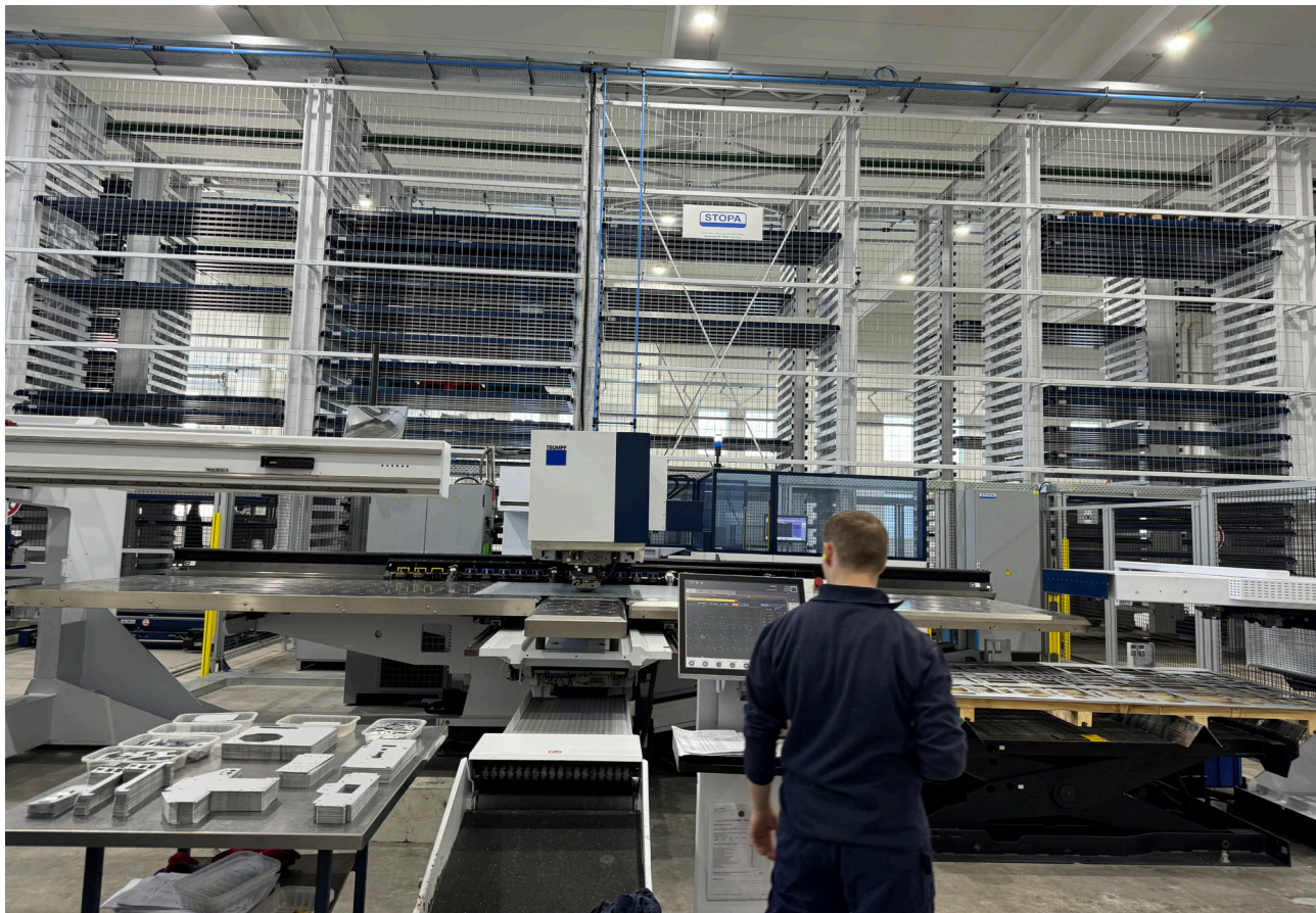
Seifert Systems Ltd. Production Line