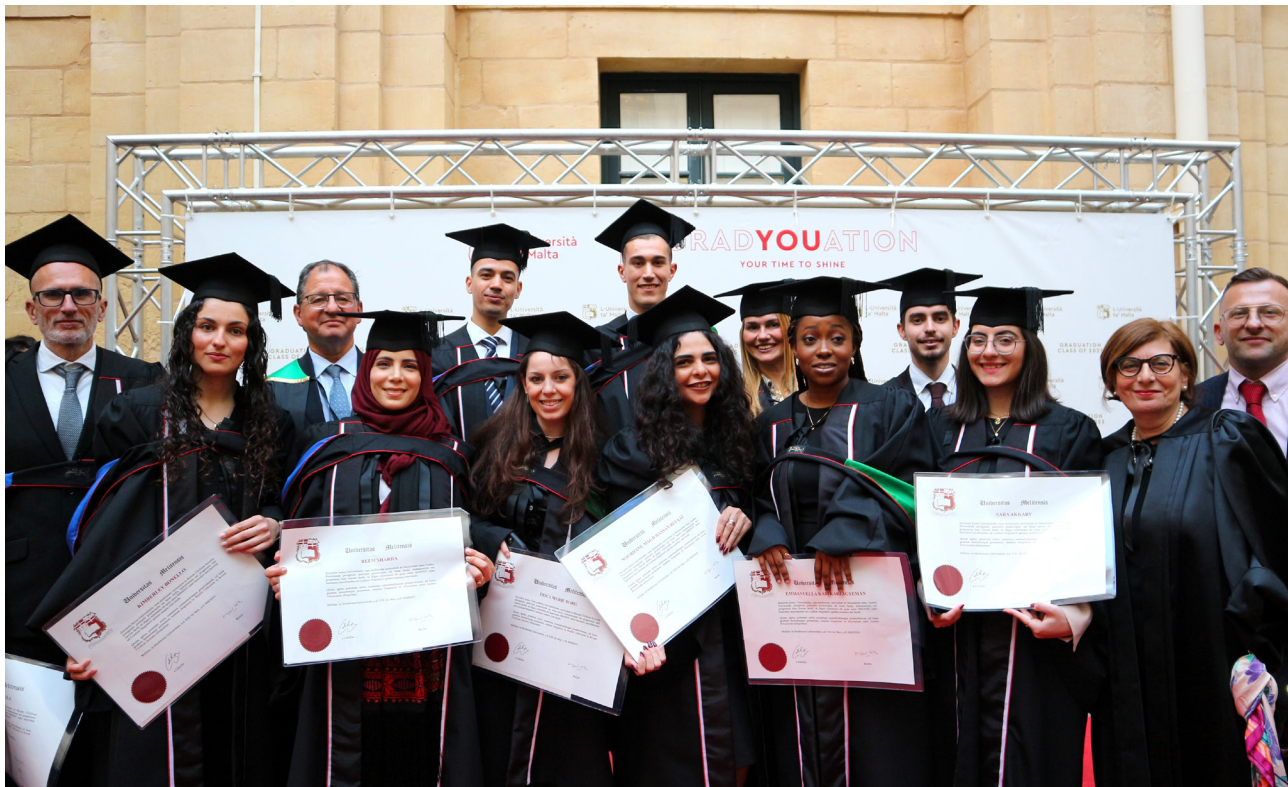
MEDAC Class 2022-2023