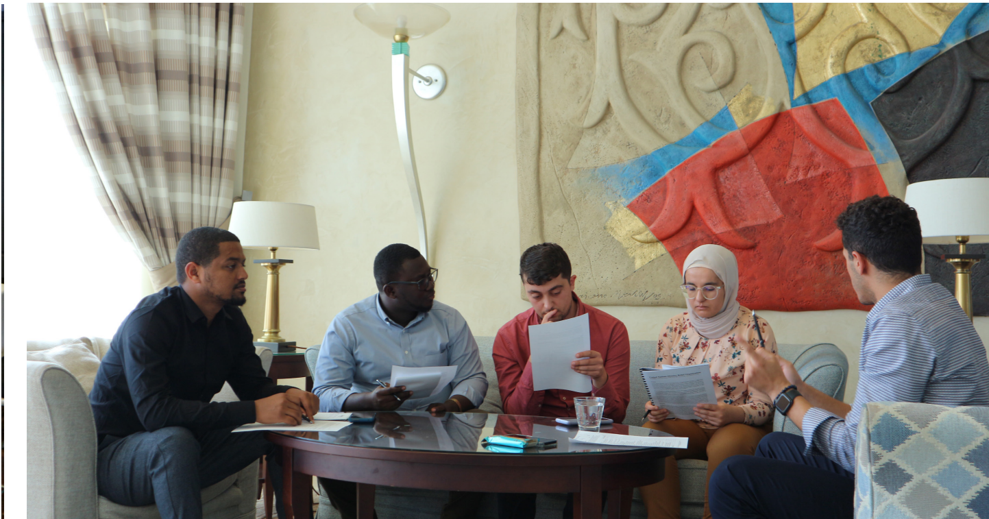
MEDAC's postgraduate students brainstorming during a preparatory session during the Seminar.