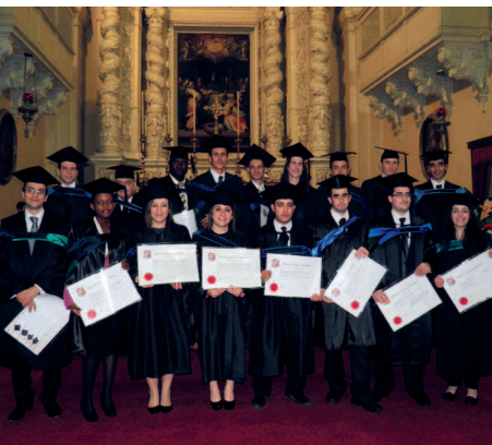
Above: MEDAC graduates of 2012 with their degree certificates.

On November 26th 2012, the official graduation ceremony of the MEDAC Class of 2011/2012 was held at the Jesuits Church in Valletta. The graduates were awarded their Masters of Arts (MA) and Master of Diplomacy (M. Dip.) and Diploma degrees. The graduation ceremony was also an opportunity for students to meet each other once again and reminisce on a very enjoyable, enriching, and unforgettable year of studying.