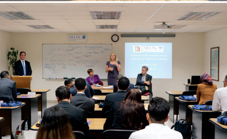
Top: M.Dip/M.A. 2017-2018 Class Photo.