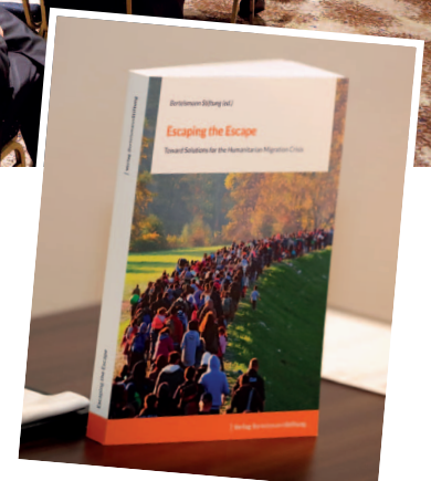
Right: Escaping the Escape - Towards Solutions for the Humanitarian Migration Crisis book launch.