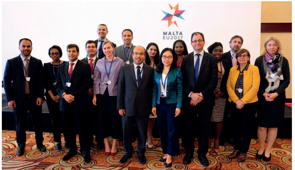
MEDAC Academic Staff alongside MEDAC students at the EUGS Conference during the Maltese Presidency.