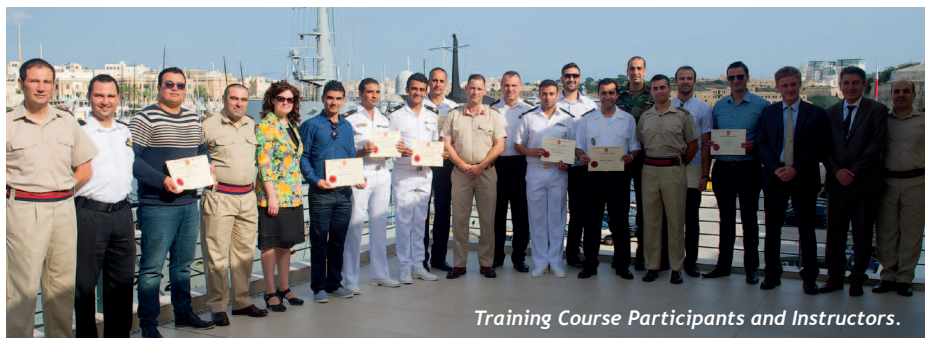
Training Course Participants and Instructors.

challenge of seaborne migration in the region. More specifically, the course sought to provide junior and mid-grade operational maritime personnel with a practical understanding of the impact of maritime law, both international and domestic, on the execution of their duties. Topics covered by the course included the sources of International Maritime Law (UNCLOS), jurisdiction principles, flag state rights and obligations, jurisdictional zones, domestic law, universal jurisdiction, rules of engagement and use of force, and the law of armed combat. The course was funded by the Swiss State Secretariat for Migration.