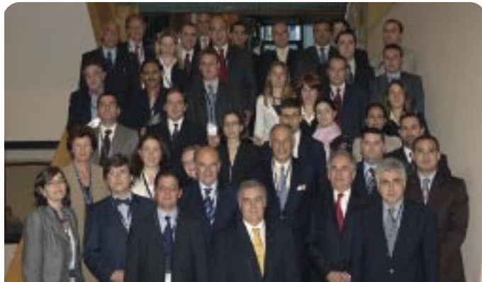
Euro-Med Seminar group photo with the Hon. Dr. Michael Frendo, Minister for Foreign Affairs, Malta.

Throughout the four-day seminar academic specialists and other professionals from both Europe and the Mediterranean presented a series of lectures on developments within each of the three chapters of the Euro-Mediterranean Partnership, namely the political and security, economic and financial, and the cultural and human resources chapters.