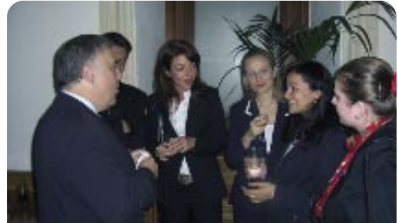
Hon. Dr. Michael Frendo meeting MEDAC students at the reception following the keynote address.

MEDAC's international vocation is also evident from the large number of international conferences, workshops and study visits it has held on a regular basis in collaboration with numerous institutions and governments including, the Arab League, Wilton Park, EuroMeSCo, the Nordic Council, the Geneva Centre for Security Policy and the governments of Tunisia and Egypt.