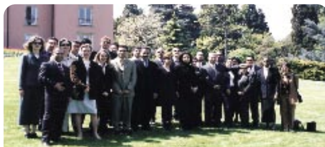
MEDAC Class of 2001-02.

Malta as a country is an unforgettable experience and even though it is very small, there are so many things to see and places to explore, that when I was leaving I had a feeling I did not see all of Malta. So, I promised myself to come back again. Hopefully that will happen soon!