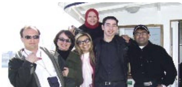
MEDAC students from class 2004/2005 in Geneva.

My nine-months study in Malta is an unforgettable and unique experience. Not only did I greatly improved my professional capability through my academic studies there, but also I learned a great deal through extra-curricular activities. My classmates were from different