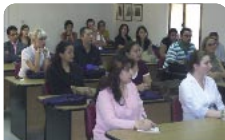
MEDAC Class 2006/07 on their first day of lectures at MEDAC.