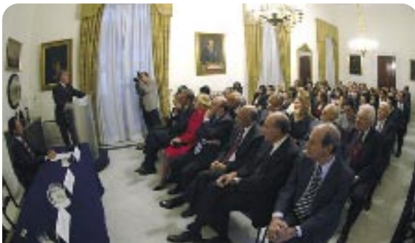
Hon. Dr. Michael Frendo, Minister for Foreign Affairs of Malta delivering the Keynote Address.

Malta's Minister of Foreign Affairs, the Hon. Dr. Michael Frendo delivered the keynote address of the ceremony to the audience present that included the diplomatic corps in Malta. During his address, Dr. Frendo highlighted the important role that diplomats play in contemporary international relations and called for diplomats to adopt a more "preemptive diplomacy" approach to try and avoid potential crises from escalating into conflicts. Dr. Frendo also encouraged MEDAC's students to participate actively in the Alumni Association that had more than four hundred members and was already proving to be a vehicle where colleagues could interact with one another on a regular basis.