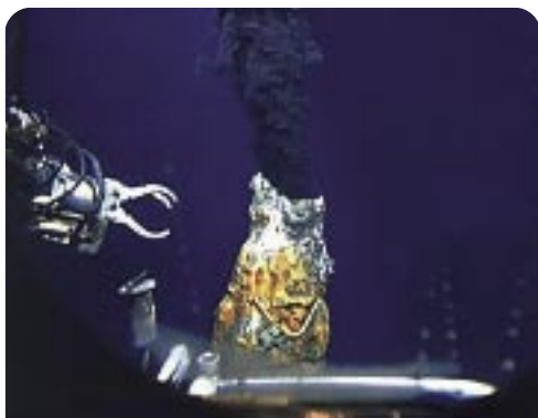
A robotic arm of an underwater vehicle at a hydrothermal vent field.

To exploit a natural resource, it must be accessible with the available technology and the exploitation-commercialization process must be economically viable. This means, for some marine economic activities, being competitive with the land-based ones. Humanity has interacted with the marine environment since the earliest times. However, man only very recently began to gain effective working access to the depth of the oceans—his intervention being limited to the surface due to lack of proper technology. Hence, this research will concentrate on the present importance and future role of deep-sea natural resources and related technological advances in exploration and exploitation techniques.