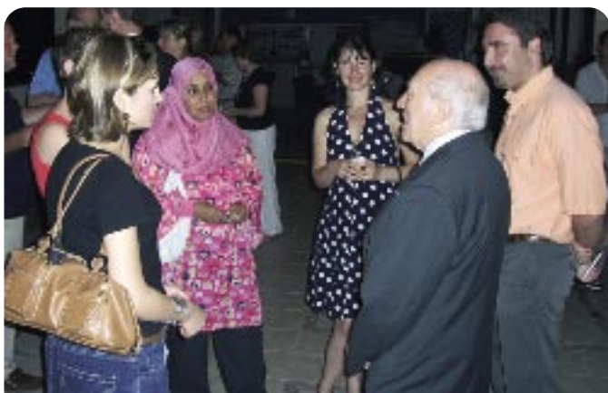
President Emeritus, Prof. Guido de Marco, Chairman of MEDAC meeting with the participants at the opening ceremony.

Between the 5 th and 13 th July 2006, the Human Dimension Programme organized the 7 th Human Rights Summer Training in cooperation with 80:20 Educating and Acting for A Better World (Ireland). This year's summer school focused on Human Rights: The Legal, Educational and Action Dimensions. As with previous editions the school was held at the Victoria Hotel, Sliema. The Chairman of MEDAC, President Emeritus Prof. Guido de Marco, addressed the participants and lecturers at an evening reception on the first day. Prof. de Marco stressed the importance of a genuine debate on human rights throughout the Euro-Med area as one of the keys to achieving peace and stability in the region.