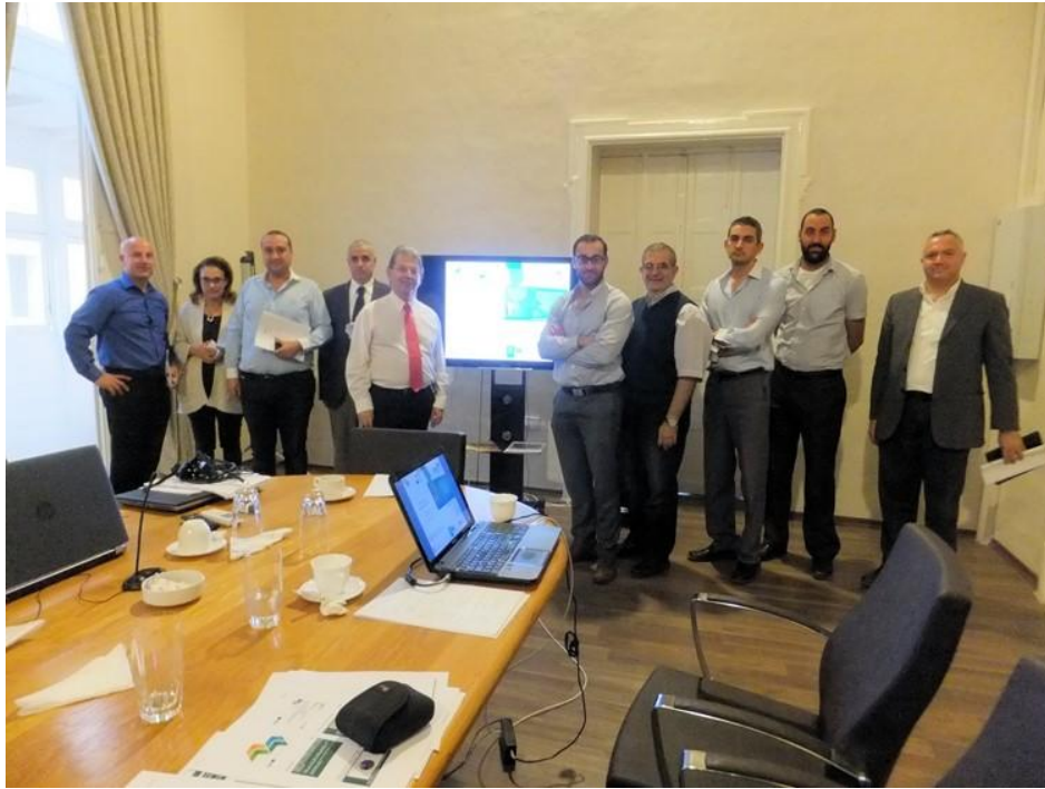
Outreach meeting with the Building Industry Consultative Council BICC, Valletta, Malta 1 st November 2016.