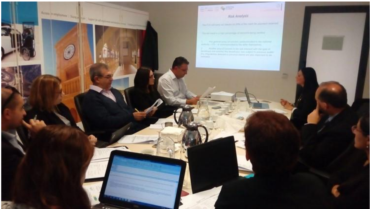
Interreg-Europe training session at the Funds and Programmes Division (FPD) Santa Venera, Malta 14 November 2016.