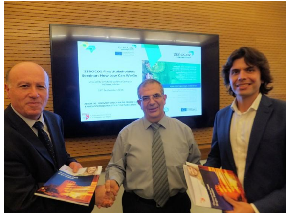
First Regional Seminar, Valletta, Malta 29 September 2016 - ZEROCO2: Promotion of Near Zero CO2 Emission Buildings Due to Energy Use.