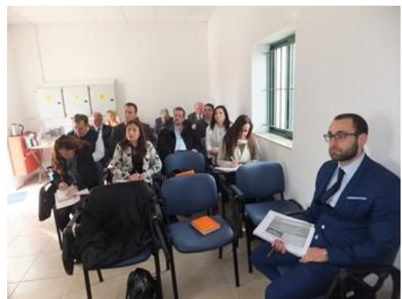
High Level Meeting, Marsaxlokk, Malta, 15 th January 2018 - Proposal for Policy Action Plan towards Near ZeroCO 2 Buildings.