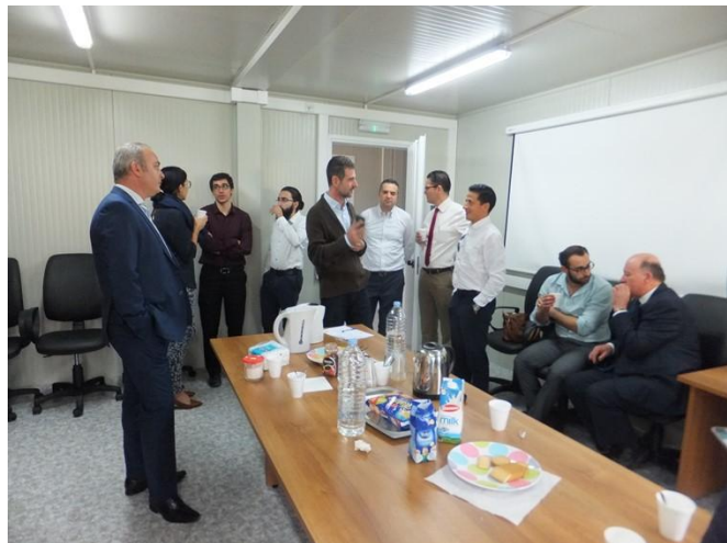
Second Regional Seminar, Marsaxlokk, Malta, 24 November 2016 - Policy Measures Towards Near Zero CO2 Buildings.