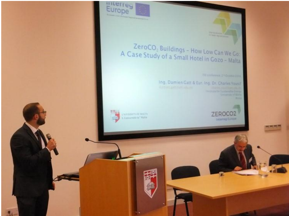
Paper Presentation at the ISE Annual Conference, Valletta, Malta, 2 nd October 2016.