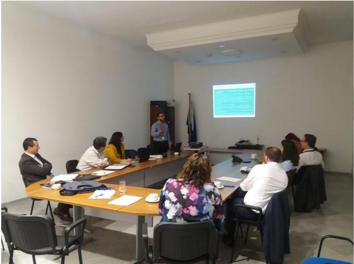
Outreach to the Ministry for Economy, Investment and Small Business, 5 th May 2017.