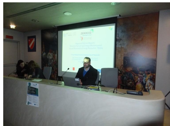
Third Interregional Meeting and Study Visit, Campobasso, Molise, Italy 13-16 March 2017.