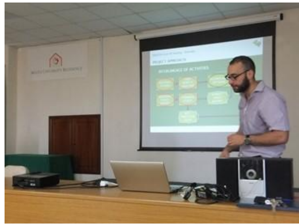
Fourth Regional Seminar, Lija, Malta, 25 th August 2017 - Policy-Technology-Action: Near-Zero CO2 Buildings.