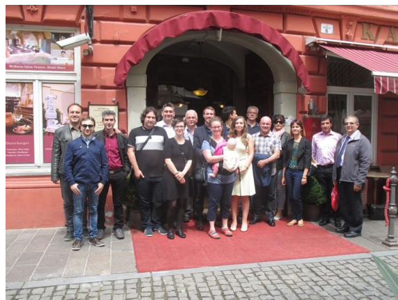
First Interregional Meeting, Ptuj, Slovenja, 9-10 June 2016.