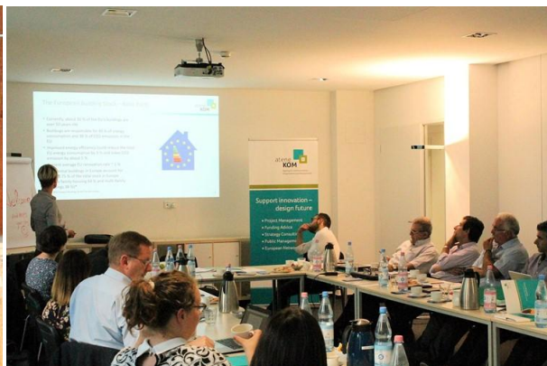
Second Interregional Meeting and Study Visit, Berlin, Germany, 14-15 September 2016.