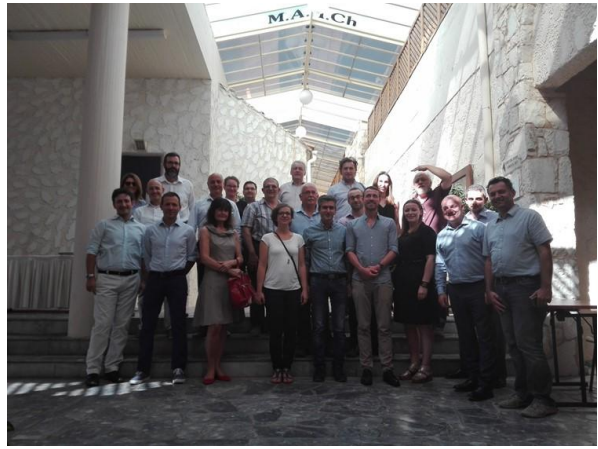
Fourth Interregional Meeting and Study Visit, Chania, Crete, Greece, 7-8 September 2017.