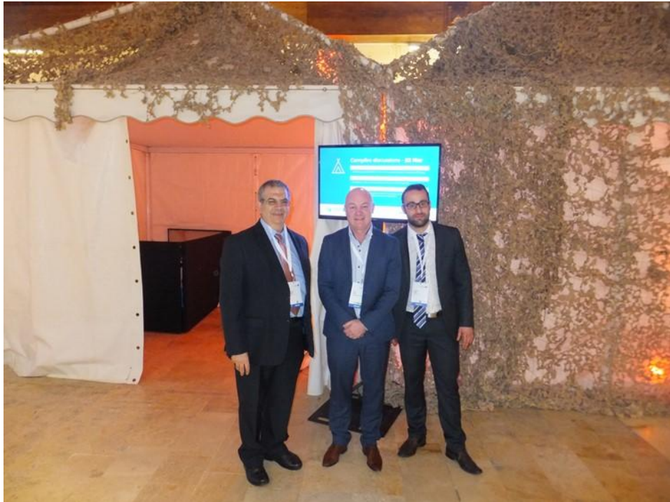
Campfire Discussion Event at the Interreg Europe European Conference, Valletta, Malta, 22-23 March 2017.