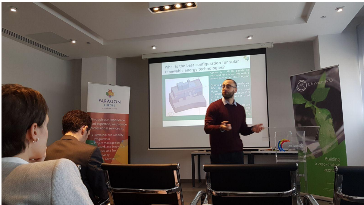
Outreach to Climate KIC event organised by Paragon Europe, Msida, Malta, 20 November 2017.