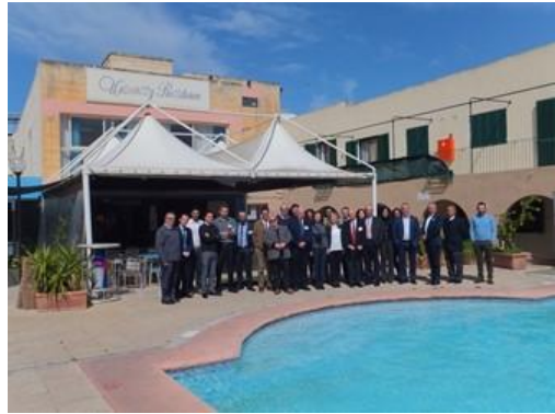
Third Regional Workshop, Lija, Malta, 8 th March 2017 - Technology Options towards Near Zero CO2 Buildings.