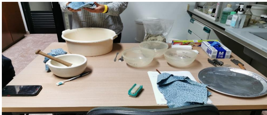
Figure 1: Set-up with equipment mentioned in text.