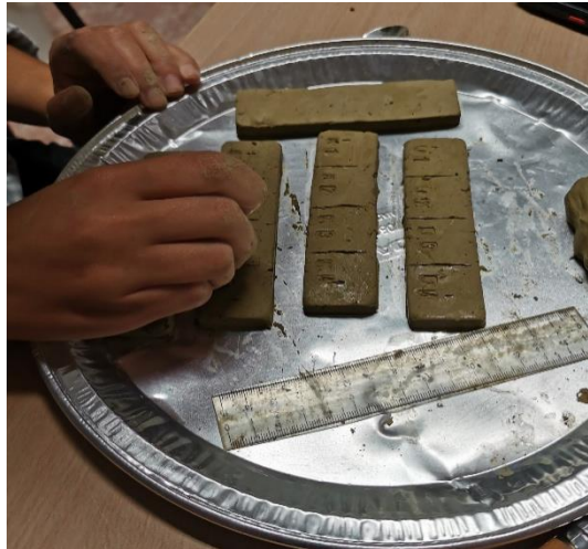
Figure 7: Letter and number presses are used to name the newly indented briquettes