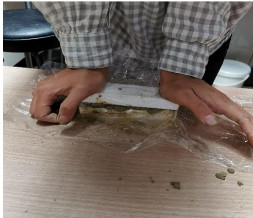
Figure 4: The two parts of the moulds are covered with plastic film and the clay is pressed.