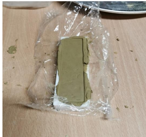
Figure 5: After pressing, the resulting briquette can be lifted out from the mould.