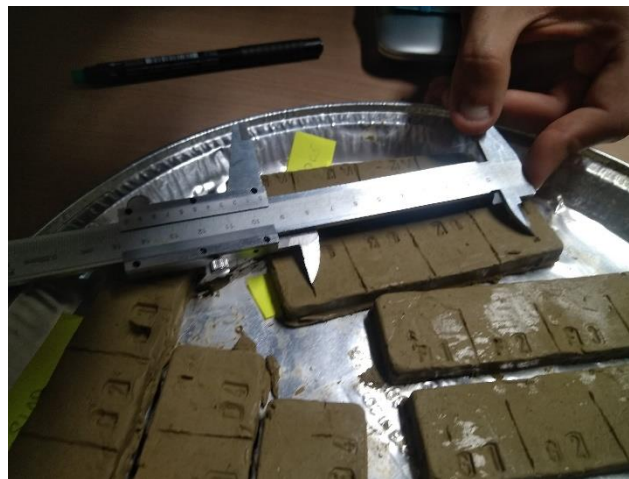
Figure 6: Two marks are indented 10 cm apart as shown in the picture. Here 1 slab is composed of four briquettes