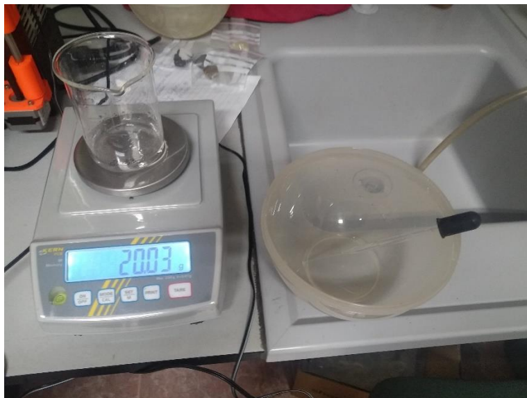
Figure 3: Water is weighed and the precise weight is recorded